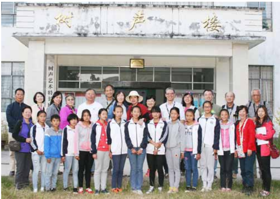
Picture with Sponsored Children at a rural high school