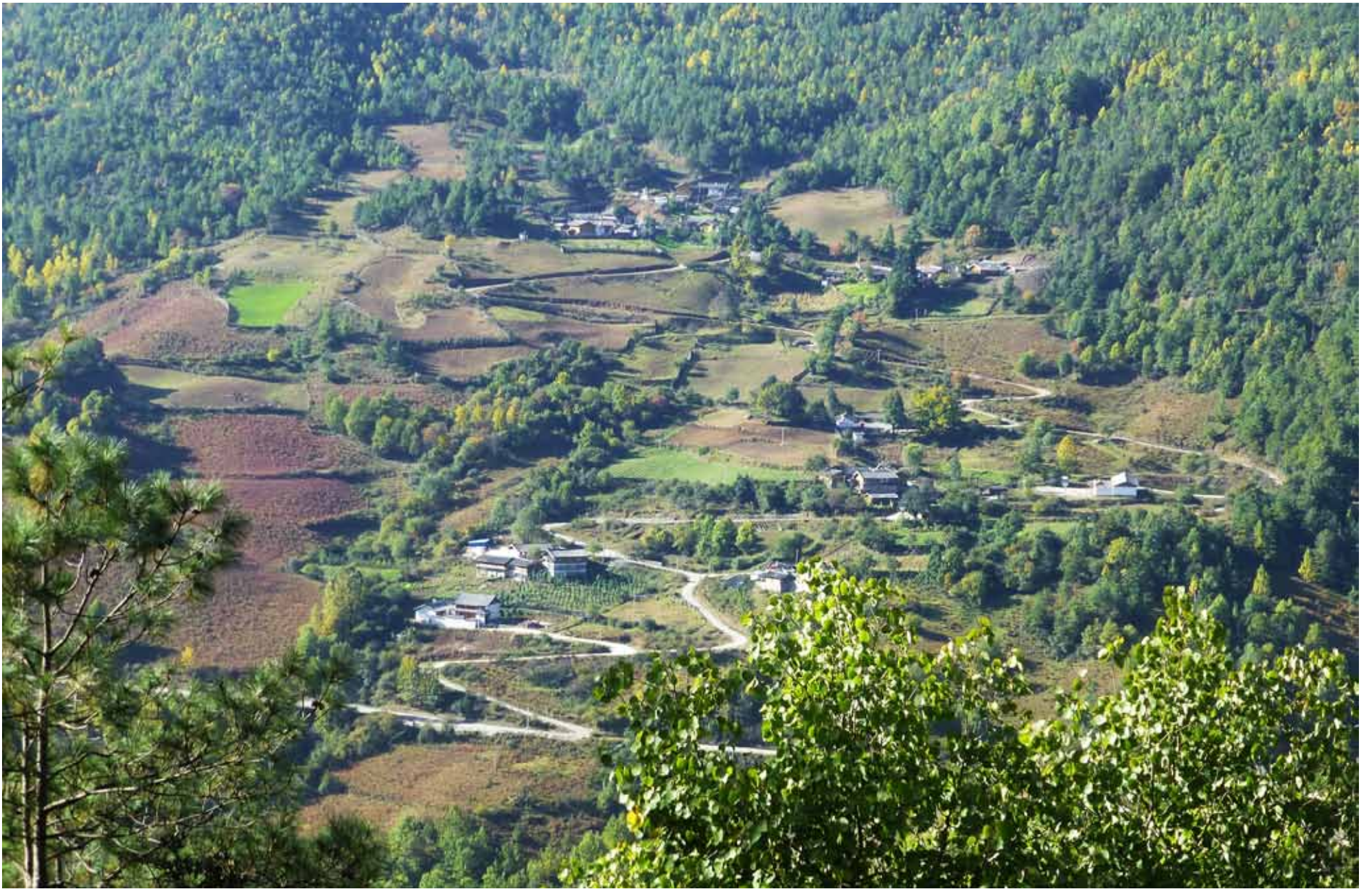
Rural Villages and Farmland nestled on the mountain side, elevation approx. 9,000 to 10,000 feet.

said. “No matter how tough their life is and how little they have, the parents will do anything and everything to send their kids back to school. And the families were all very touched by the fact that someone [Peach and its volunteers] actually cares more than their own government does.” Su added that he noticed many households where one or both parents passed away or even ran away. “There were quite a few single parents and in some cases orphans raised by their grandparents. It make me really appreciate what we have here in the States.”