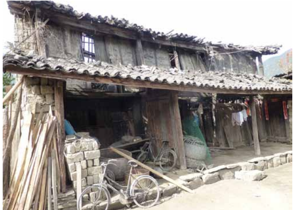
Kitchen / Living area visited

For more information on the Peach Foundation, go to peachfoundationusa.org .