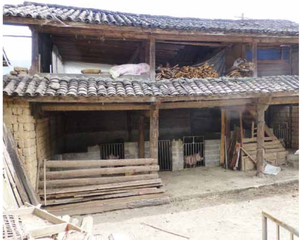
Farmhouse/Storage Shack...with Pigs