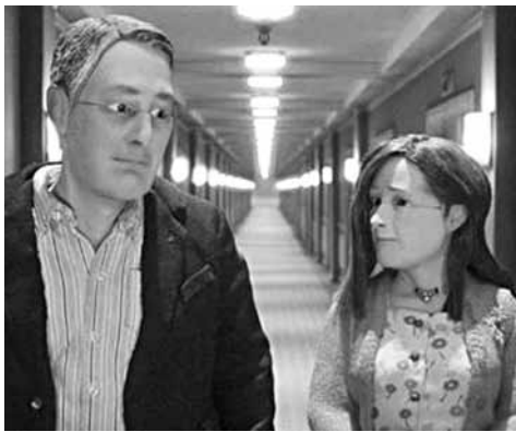
Characters voiced by David Thewlis and Jennifer Jason Leigh in Anomalisa.

Anomalisa opens with a limited release at The Landmark on December 30. Rated R for strong sexual content, graphic nudity and language. •