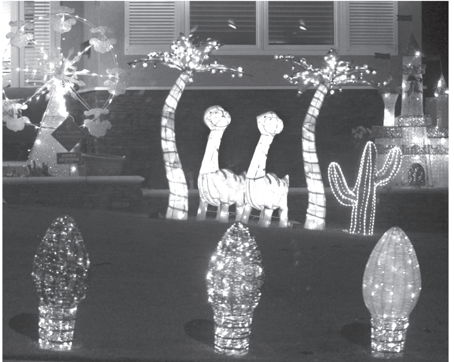
A yard full of Christmas cheer.