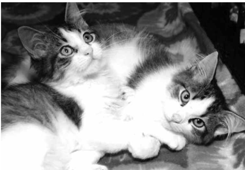
Jazz and Jax

Saving one animal won't change the world, but the world will surely change for that animal.