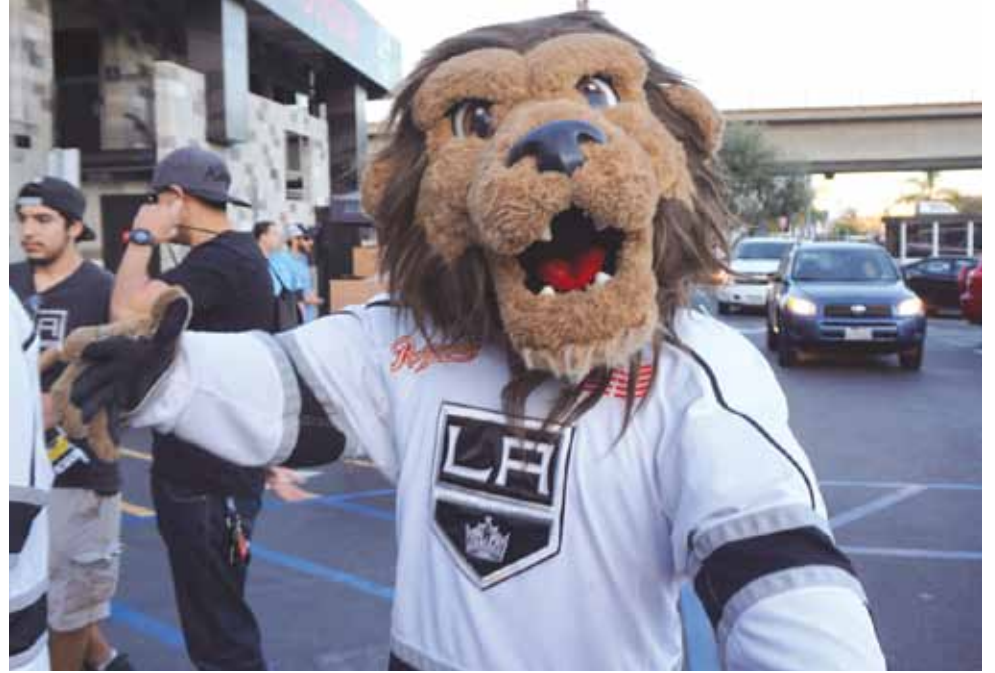
Bailey, the Kings' famous mascot, was part of the afternoon's fun and charitable activities. The Kings' Ice Crew and a KROQ music booth added to the high spirits among those present to donate to the cause.