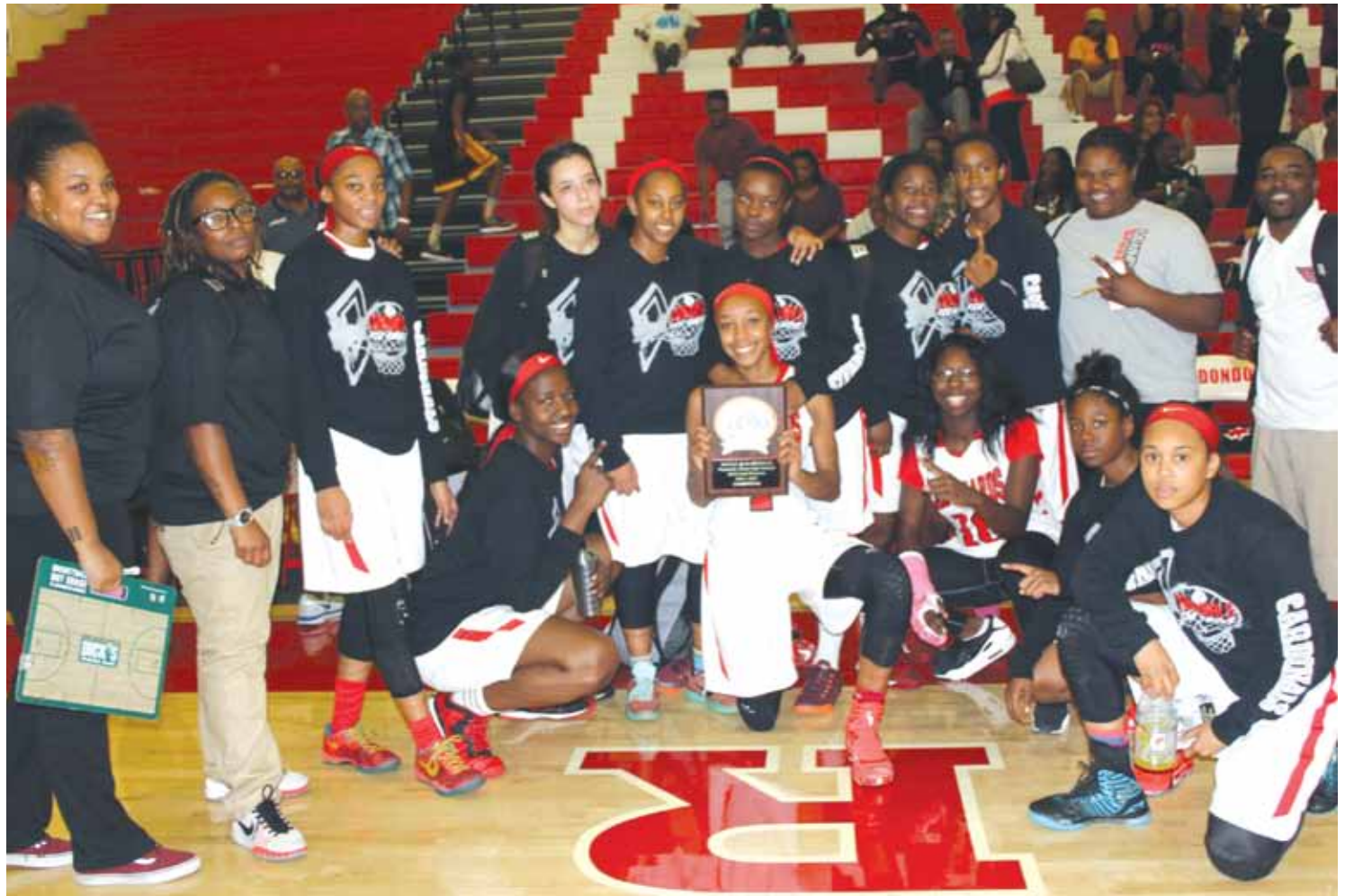
Lawndale High's girls' basketball team celebrates winning the Redondo Battle at the Beach Gold Division Tournament by topping Torrance 37-34 last Saturday. More on page 3.