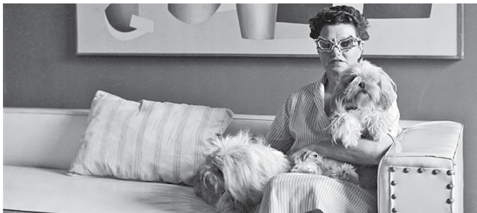
Peggy Guggenheim in Art Addict .