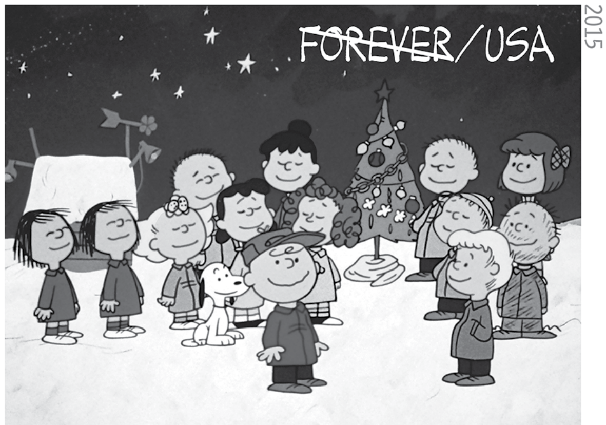
December marks the 50th anniversary of the most popular holiday TV classic of all time, "A Charlie Brown Christmas". The Postal Service has more than a billion Holiday themed stamps in stock from previous years, and has printed 800 million more to help Americans celebrate this year's holiday season. Customers may purchase them now at usps.com/shop by calling 1-800-STAMP24 (1-800-782-6724).