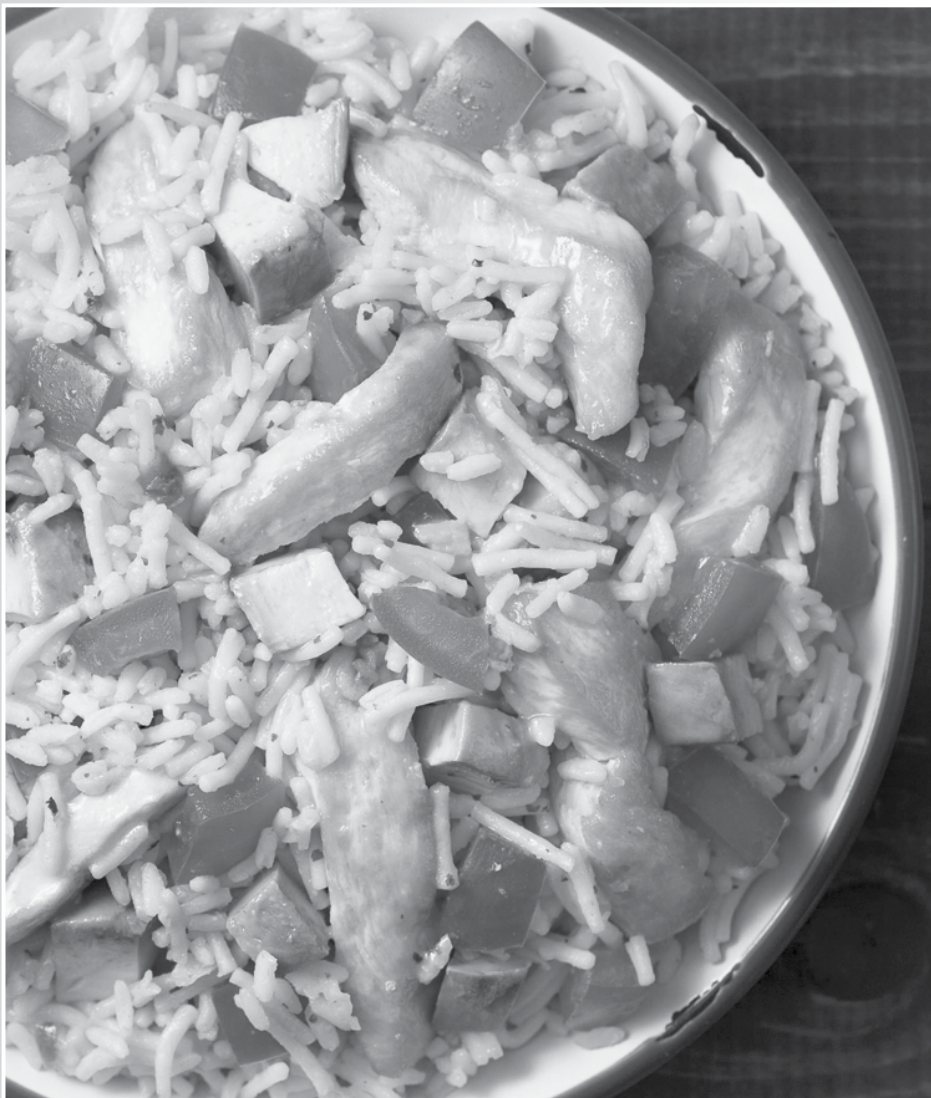
Recipe by Knorr, provided by BPT.

Prep time: 10 minutes | Cook time: 15 minutes | Serves 4