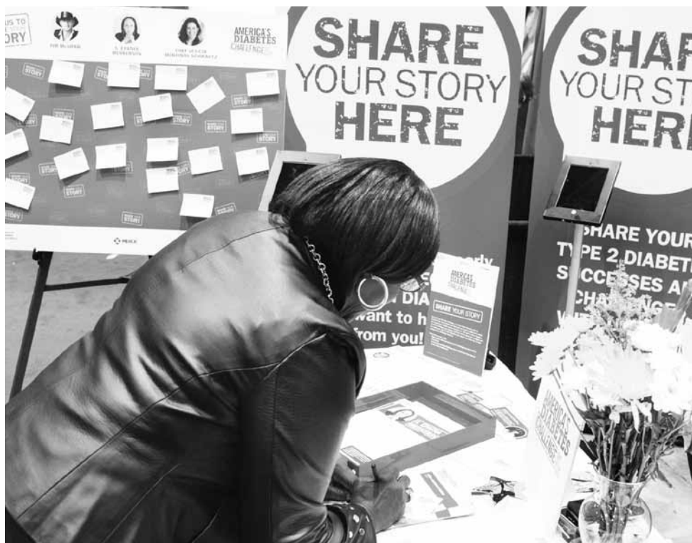
An attendee at an American Diabetes Association EXPO visits the America's Diabetes Challenge (ADC) booth; ADC is a program from Merck and the Association that travels the country to urge people with type 2 diabetes to work with their doctor to set and reach their A1C goal, and to share the challenges and successes they face managing the disease. November is Diabetes Awareness Month.

Hoping to inspire others with type 2 diabetes, Merkerson has shared her own personal struggles and accomplishments after living with the disease for nearly 14 years. "After my diagnosis, I got serious about my health