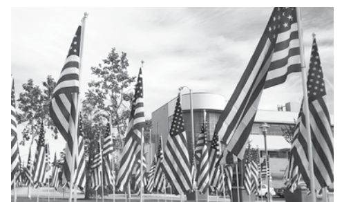
The City of Lawndale Recognized Veterans Day With 100 Flags at the Civic Center.

The Lawndale City Council will hold its next regular council meeting on December 5 th , at 6:30 p.m., in the Lawndale City Hall Council Chambers. •