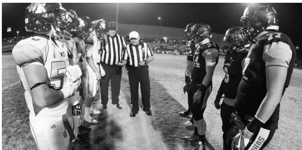
West Torrance and Lawndale captains meet at midfield for the coin toss.