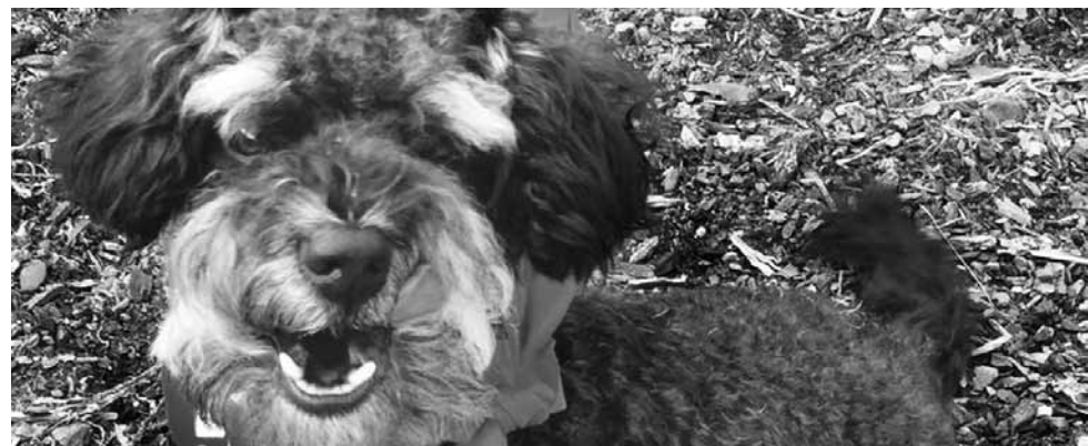
Randy is living the good life in West LA!

Congratulations to Randy , our mid-June rescue who had been dumped by his owner and his new family. This 3.5-month old pup had some real behavioral issues that included little socialization skills and being pretty dominant. With the help of the folks at Yellow Brick Road Doggie Daycare and a lot of patience, he has blossomed. We're happy to say that