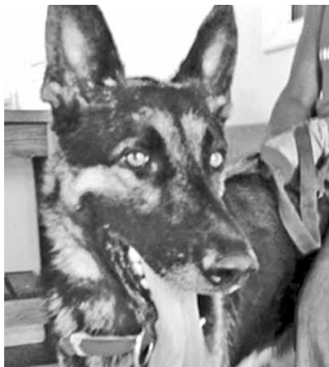
Thorin ready for fun!

Hello, my name is Thorin , which is Scandinavian for Thunder. I'm a three-year old male German Shepherd who was rescued from the San Bernardino City shelter the end of June. I currently weigh 66 pounds but when I was found and turned in to the shelter, I was very thin and filthy – a total mess. My ideal weight should be around 80 pounds so you can imagine how emaciated I was. I get along with other dogs and I'm very friendly with people – even those I've just met. I'm learning all kinds of skills – leash manners, sit and I even ride calmly in the car. I keep hearing about something called cats and another called children but since I'm not acquainted with those terms, I'm not sure how I would do with those. Thorin can be seen anytime at Yellow Brick Road Doggie Playcare in El Segundo Call 310-606-5507 or email southbaydoggie@hotmail.com for appointment. •