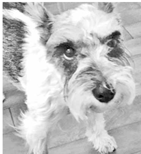
Esmeralda is a petite parti-colored miniature Schnauzer.

They call me Pinky – but don't worry, I'm not pink. What I am is an adorable one-year old female Terrier mix. Folks wish they knew what I was because I'm so darn cute they want to clone me. I'm just a bit of gal, only eight pounds and I was rescued from a LA county