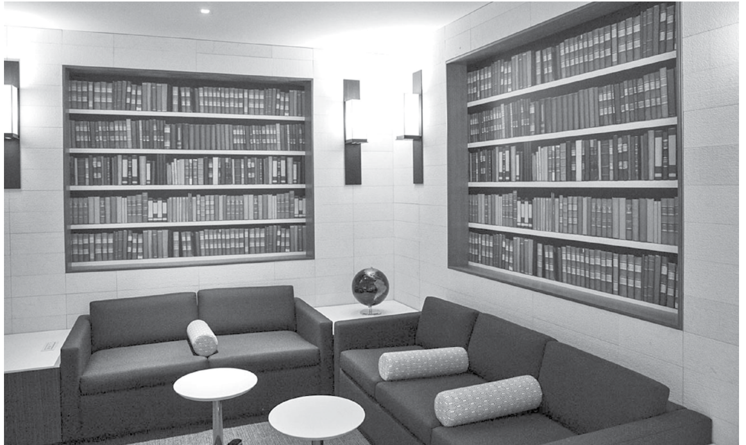
The library at LAX's Star Alliance Business Lounge.