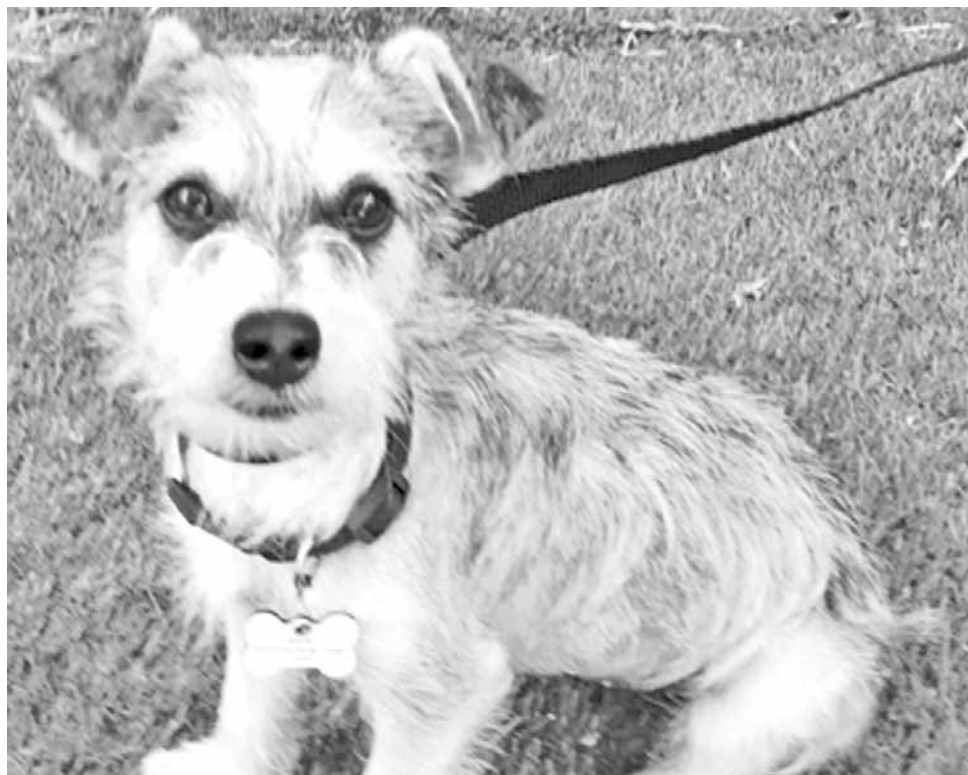
Pinky is outgoing and sweet.

shelter where they said I was a stray. I do shed some but what are a few hairs among friends? Especially when I have so many other things going for me. I'm friendly, good with other dogs, outgoing, quiet and just too sweet to be real. I'm tired of living alone and am ready to share my life with my forever family. If you are interested in Pinky please email info@msfr.org for more information.