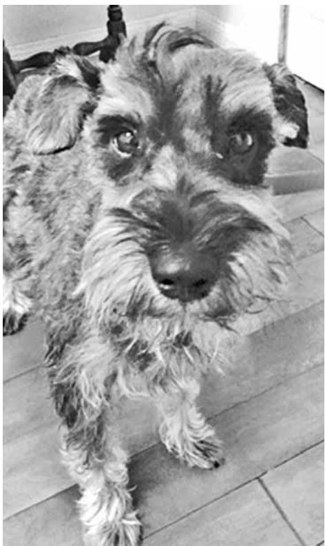
Harper is in need of a kind family of his own.

We are looking for volunteers to help with our pet adoption fairs which are held every Saturday at the Petco located at 537 N. Pacific Coast Highway Redondo Beach 90277, from noon-3: 30 p.m. If you are interested in volunteering and can commit to at least one Saturday a month, please contact us at info@msfr.org . You can also visit all of our Miniature Schnauzers & Friends rescues at the adoption fair or check out our website, www.msfr.org . If you have any questions about a particular dog's availability you can email us at info@msfr.org . Schnauzers! Bet you can't adopt just one!