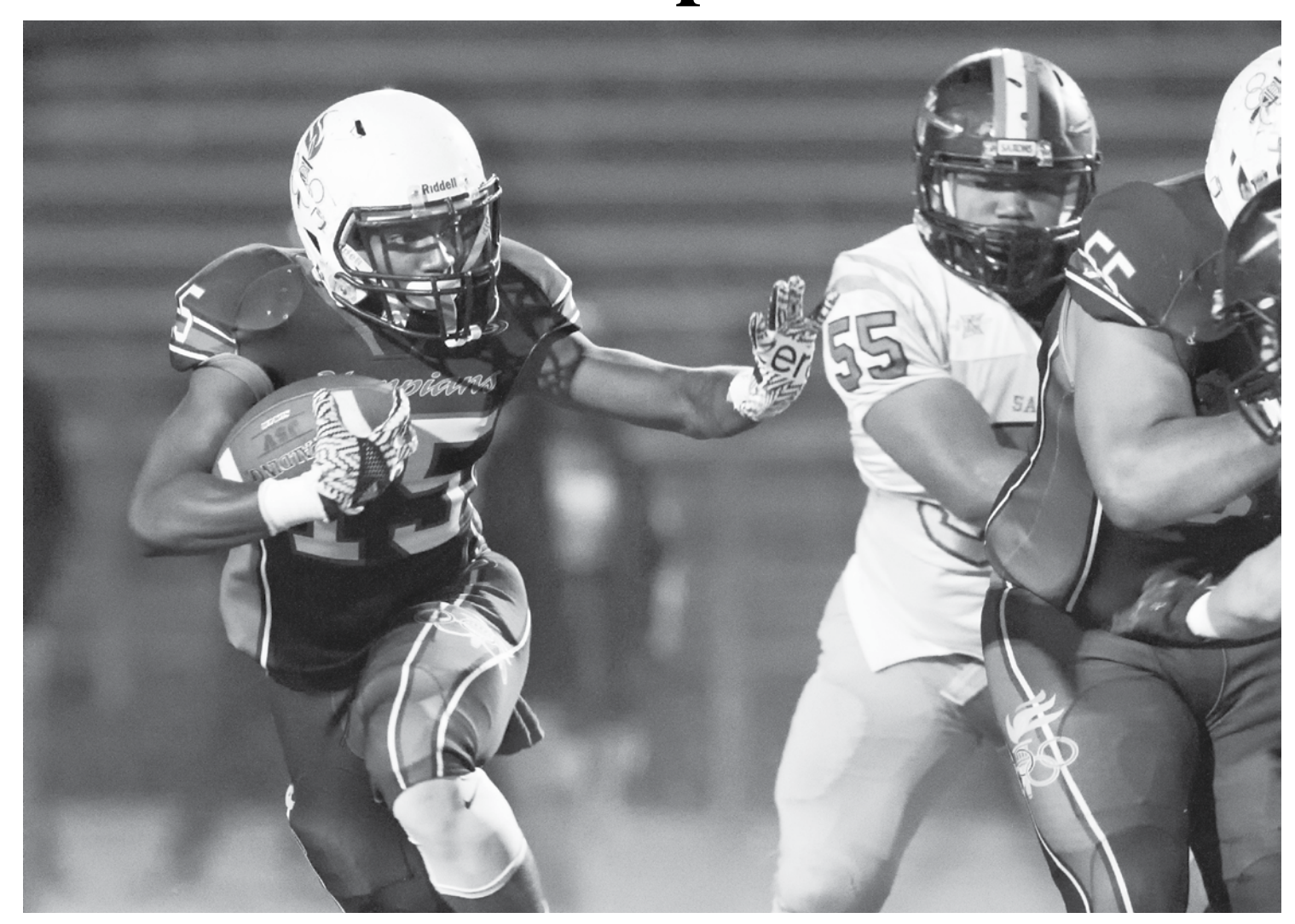
The Leuzinger High School football team scored early and often in a 68-28 win over North Torrance last Friday. The Olympians improve to 5-2 overall on the season and 2-0 in Pioneer League play. Leuzinger will play Torrance Friday at 7 p.m.