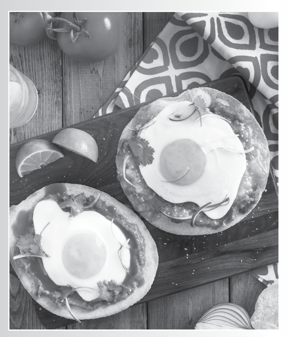
Recipe by American Egg Board, Provided by BPT

Prep time: 10 minutes | Cook time: 20 minutes | Makes 4 servings