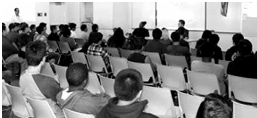
Hawthorne High School students were treated to a special presentation and Q&A session when representatives from the Jet Propulsion Lab (JPL) Speakers Bureau visited the school's Engineering Quad auditorium on Monday, October 5, 2015.