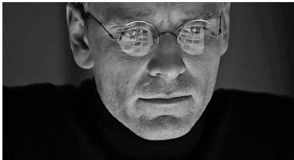
Michael Fassbender in Steve Jobs.

Michael Fassbender, easily one of the greatest working actors we have today, tackles the character of Steve Jobs from the immediate get-go. He never feels disguised as the character, but instead embodies the classic approach where he is still very much himself within the spectrum of this incredible character. As is the case with nearly every element of the film, the ensemble of performers all show-up and deliver knockouts. Supporting cast members Kate Winslet, Seth Rogen, Michael Stuhlbarg, and Jeff Daniels