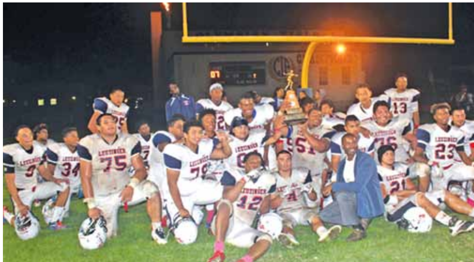
Leuzinger High's football team won the Mayor's Cup by downing rival Hawthorne 34-13 in a non-league football game last Friday at Leuzinger.

The Cougars begin the Ocean League at home in another "Battle of the Winless" against another 0-5 squad in Santa Monica. The Vikings, who have a long history of football success, are already off to their worst start since their 0-10 1992 squad after getting blanked by last year's