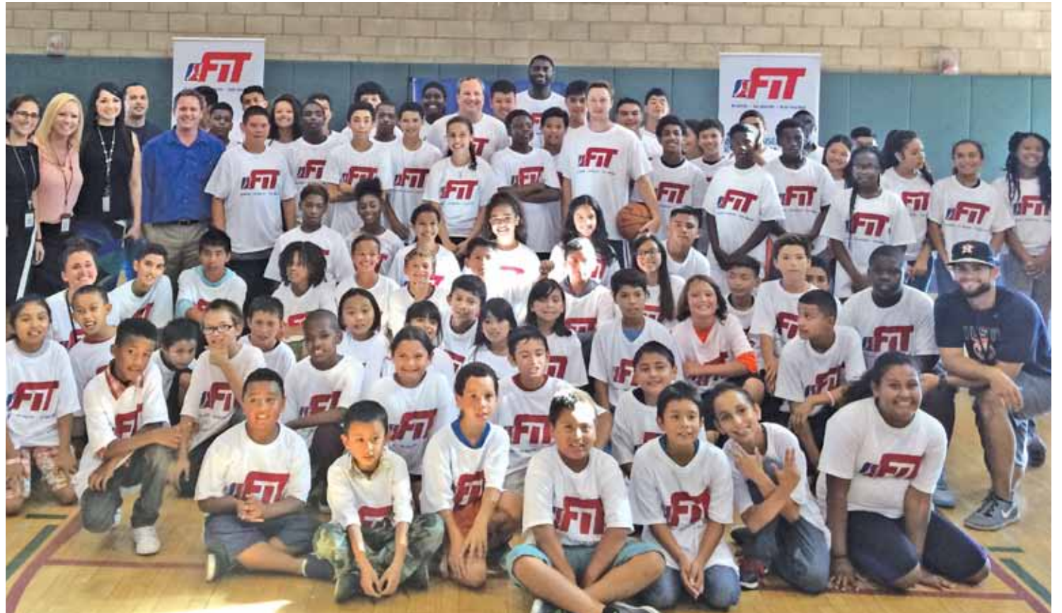
Focused on building healthier communities, the D-Fenders and Kaiser Permanente hosted a NBA D-League FIT clinic at Will Rogers MS. Students worked on basketball drills with D-Fenders coach and players who encouraged fans of all ages to be active, eat healthy and play together. For more on wellness at Lawndale Elementary School District, visit www.lawndalesd.net/wellness.