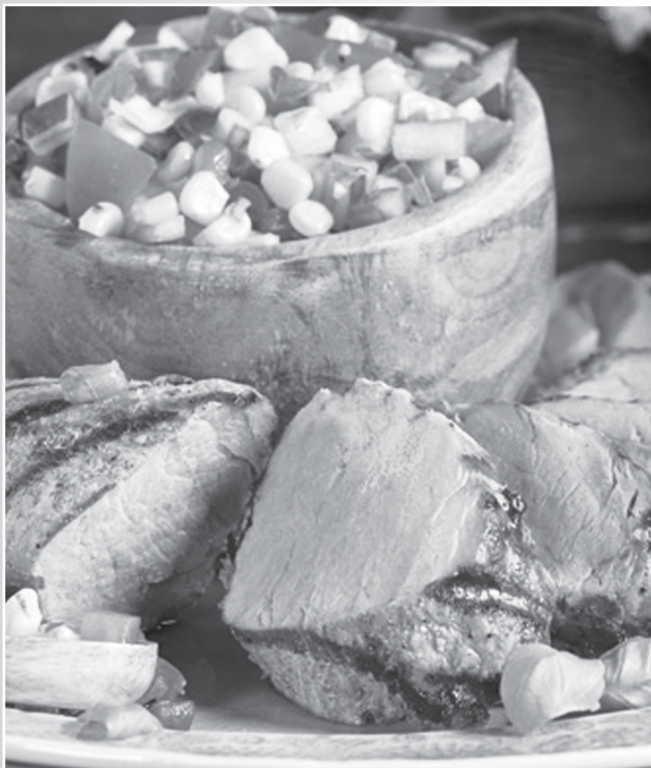
Recipe by smithfield, provided by BPT

Prep Time: 5 minutes | Cook Time: 25 minutes Makes: 4 servings