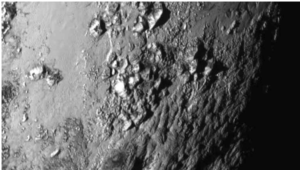
New close-up images of a region near Pluto’s equator reveal a giant surprise – a range of youthful mountains rising as high as 11,000 feet (3,500 meters) above the surface of the icy body.