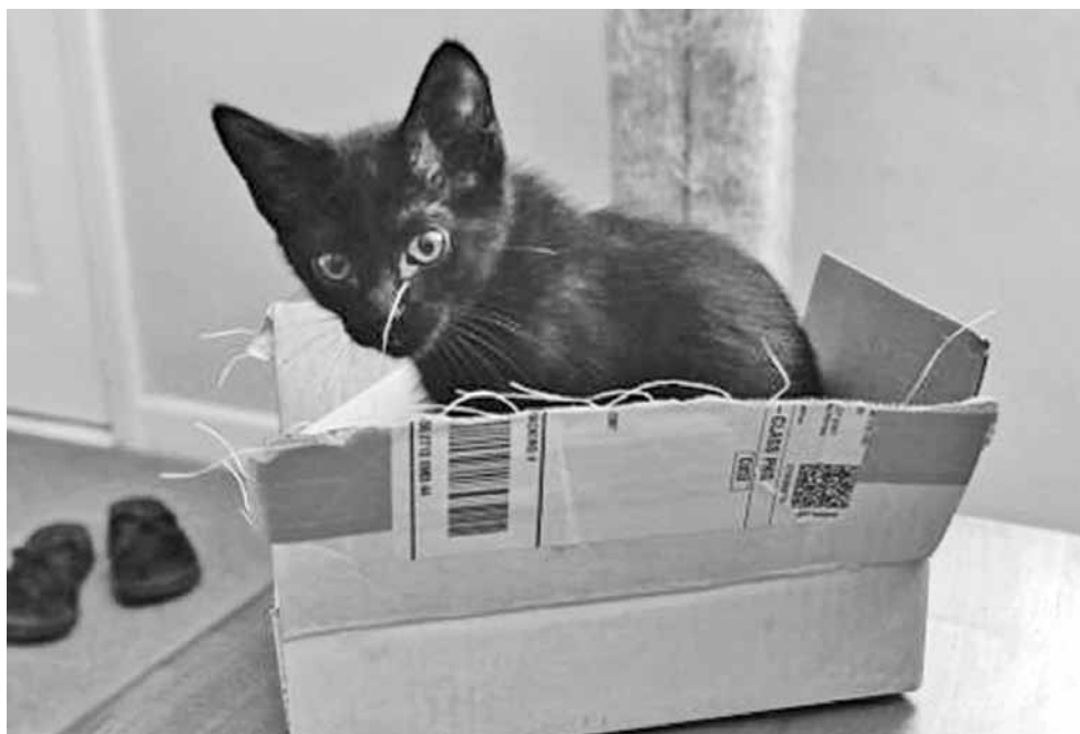
Arthur 'talks' to his human friends.

Looking for your purr-fect match? Kitties of all colors and sizes are ready for the forever home with you.