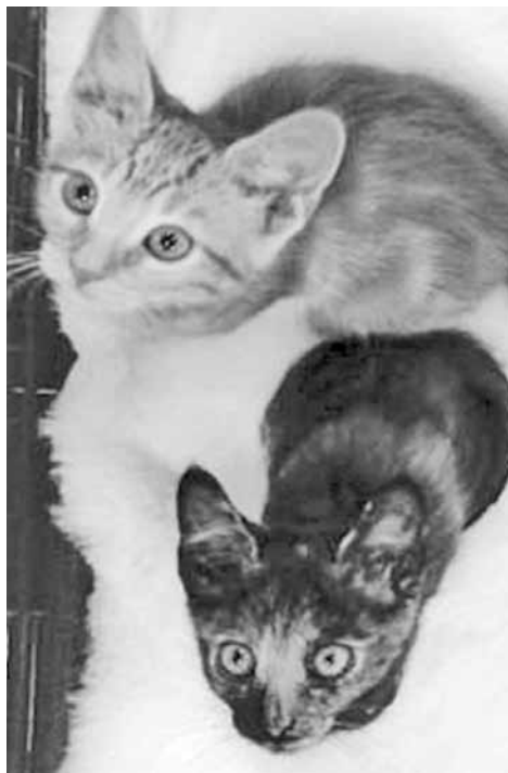
Maddie needs a home with a kitty friend.

Rizzo can be just a little shy at first, but