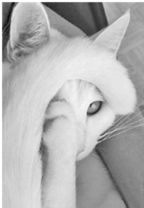
Babbage is deaf but is also outgoing and loves to hang out.