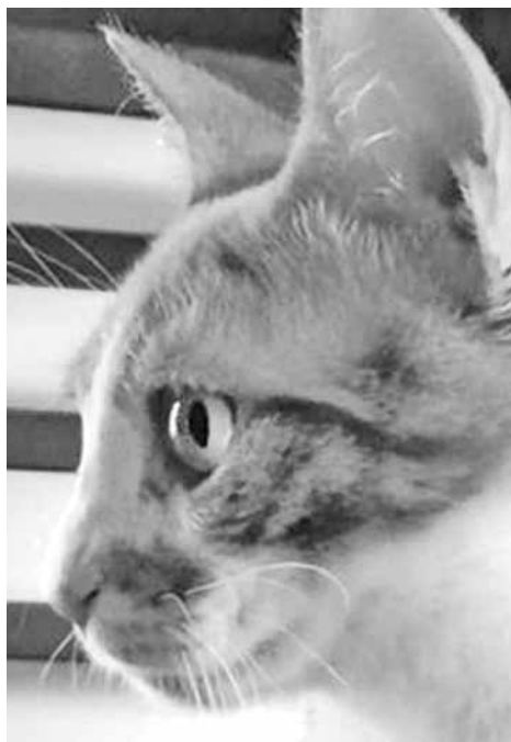
Phoenix has a wonderful personality.