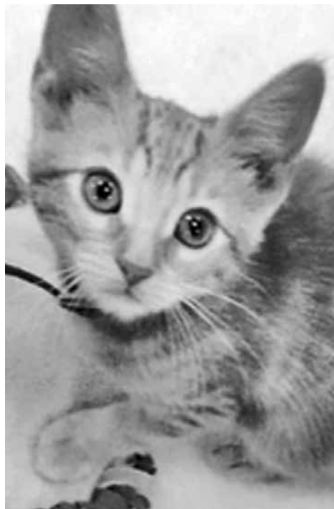
Cerise is smart and cute.

Be kind. Save a life. Support animal rescue.