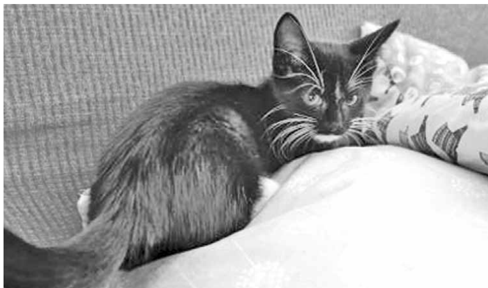
Rizzo is easygoing and sweet.

once he settles in he doesn't hesitate to cuddle on anyone's lap. He is a dear, sweet, easy-going, gentle boy, who mostly wants to be lying next to or on the humans. When he's not sleeping with you, he prefers the company of his brother Arthur who is never far away. He is usually quiet, however, when the mood strikes, Rizzo can belt out a loud meow! Such as at food times. He and his brother Arthur love each other's company and would like very much to be adopted together. Like his brother, Rizzo faithfully uses the litter box and hasn't shown much interest in furniture destruction.