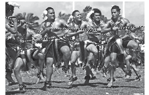
Dancers celebrate Pacific Island heritage, at Siale festival in Torrance

The Siale Festival 2016, celebrating the Pacific Island culture and community, launches August 20 at the Torrance Cultural Arts Center. A full list of activities can be found at TFSCA.org