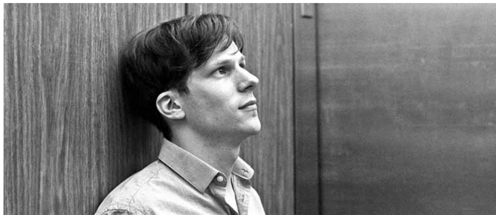
Jesse Eisenberg in Louder Than Bombs . Courtesy of The Orchard

What sets Louder Than Bombs apart from other films of recent memory are the surreal moments Trier infuses within the story. Disregarding the traditional method of linear storytelling by shifting between the past and