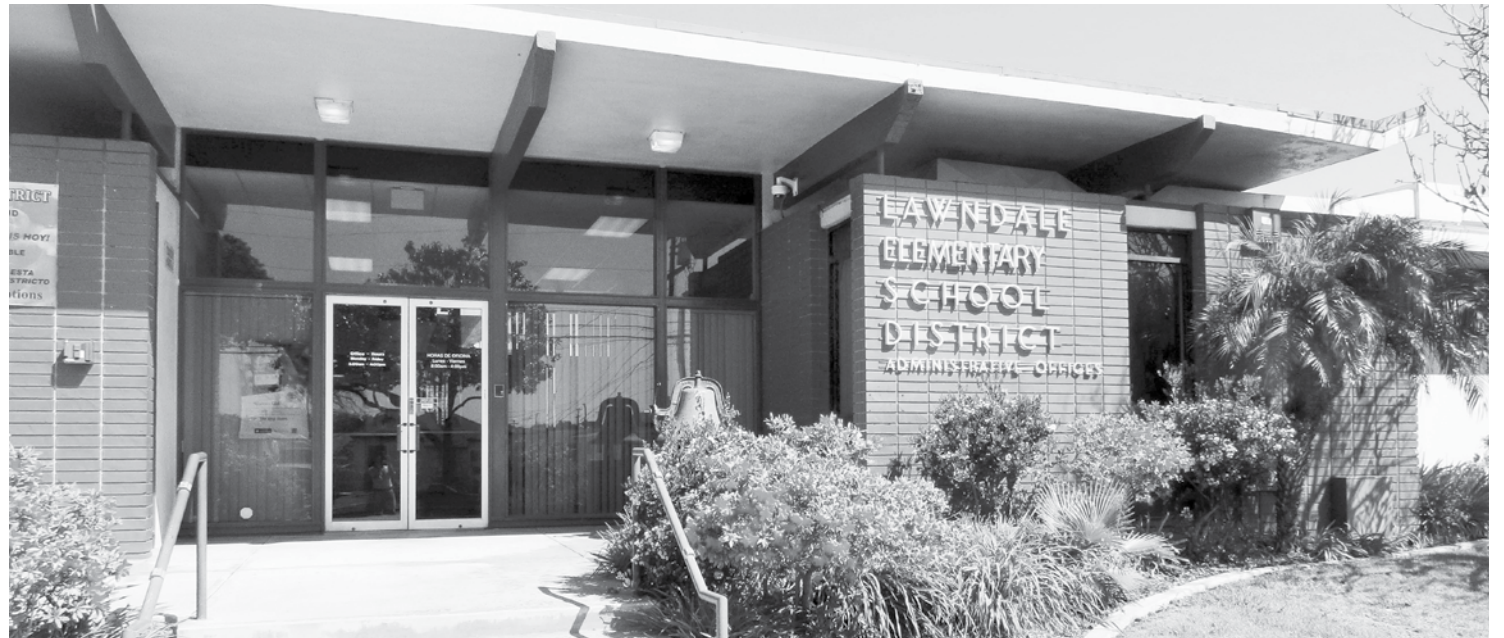
On April 5, State Superintendent of Public Instruction announced Lawndale Elementary School District will be one of this year's honorees for the prestigious recognition. School Attendance Review Boards (SARB) from throughout the state apply annually for the Model SARB Recognition Program, which awards SARBs that use superior strategies to promote attendance improvement and dropout prevention.