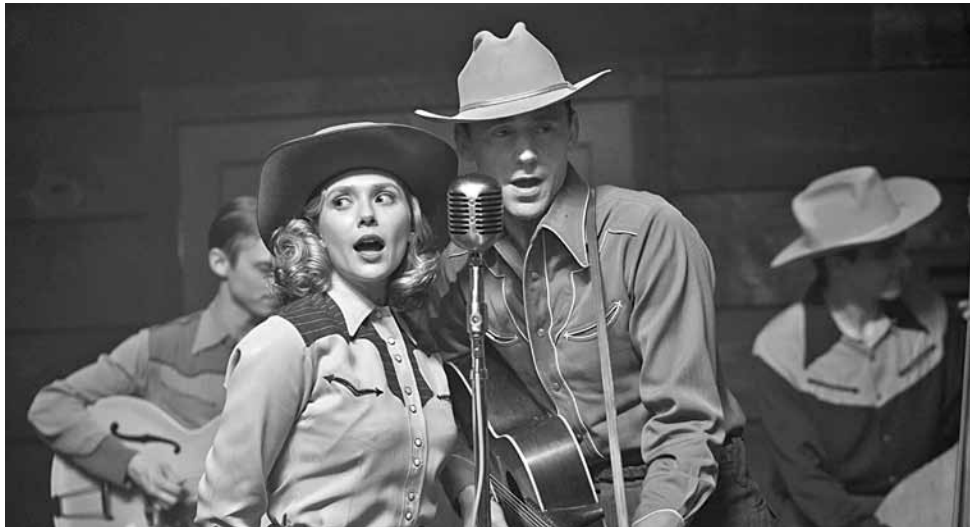
Elizabeth Olsen as Audrey Williams and Tom Hiddleston as Hank Williams.

As biopics go, and as another rock biopic to profile a legendary American icon country singer, I Saw the Light won't be able to distance itself from the Johnny Cash movie Walk the Line , which continues to age and arguably stand as one of the finest biopics ever made. Where Cash's devil-may-care attitude was rebounded by his madly-crazy love for one Ms. June