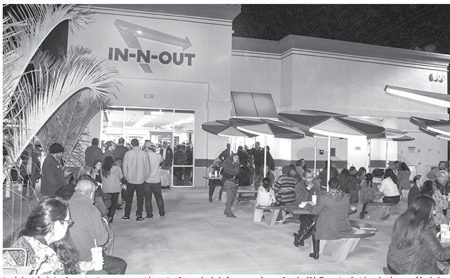
A packed patio for the In-n-Out opening. At a pre-opening special event, In-n-Out treats hundreds of customers to dinner on December 29th. The new In-n-Out is located on the corner of Sepulveda and Mariposa in El Segundo.