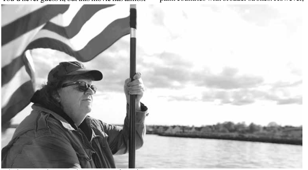
Michael Moore in Where To Invade Next.

educated viewers will know about. Moore isn't focused on shaming America though: he's interested in showing how fantastic these other countries are when in action. Of course, any documentary has the tendency to be biased and with Where To Invade Next running at only 110 minutes, Moore must paint countries with broader strokes. However,