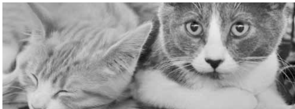
Tiger (right) is a young cat who needs a home with lots of company (but no dogs). Sam (left) has velvety fur and would love for you to pet him.

Be kind. Save a life. Support animal rescue.