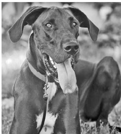
Magnum is a loving Great Dane looking for a new owner.

Magnum is a purebred Great Dane. He is two years old and was owner surrendered to us because his prior family was moving and couldn't take him along. Magnum is a great dog and is looking for a family who is crazy about Great Danes and familiar with the breed. He lived with a small terrier at his prior home and visited doggie daycare on a regular basis. Magnum is sweet, loving, and tender-hearted. He is good with kids, but would be best with children over 7 due to his large size (and no cats). He is in foster care and can be seen by appointment only at our