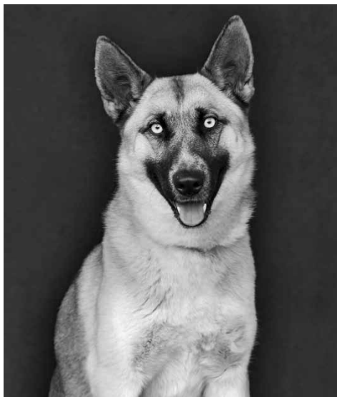
Sonji is a German Shepherd/Husky mix who isn't quite a year old yet.

Sonji was owner surrendered because her family did not have time to raise a puppy. She is a great mix of German Shepherd and Husky and was born on February 4, 2014. Sonji is a very smart dog who is also gentle, calm, sweet and very loving. She is a little shy at first, but loves all the dogs at our animal rescue including the puppies. She is good on leash, will sit and lay down on command and loves to go for walks. Sonji is spayed, current on vaccinations, dewormed, and microchipped.