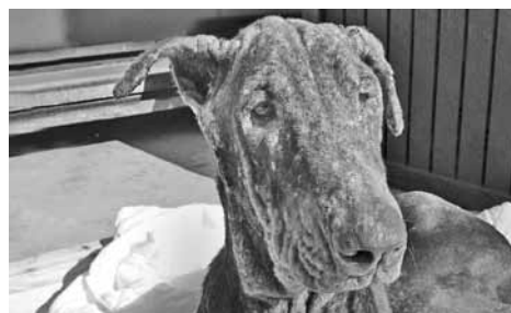
Please consider donating to Animals Rule: it helps puppies like Louie recover and find new forever homes.

Please take a special look at little Louie. This is the ugly, heartbreaking side of pet rescue. Louie is a seven-month-old purebred red Doberman Pinscher who was purchased from a breeder, had his ears cropped and then was chained in the backyard at 3 months of age when he came down with mange. This poor pup has been suffering from demodex mange for the last four months. His prior owner was not committed to the medical treatment and brought him to her local vet to be euthanized. She was talked into owner surrendering Louie by one of the veterinarian technicians and he was brought to us. The