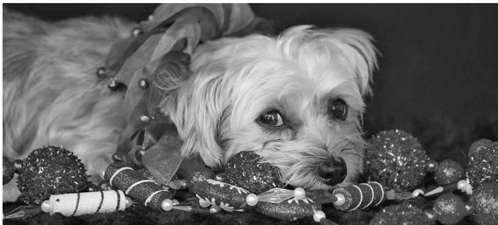
Prince is a sweet and playful Yorkie mix.

Jump into the holiday spirit and adopt a "pet without a partner" to give a homeless pet a second chance in life.