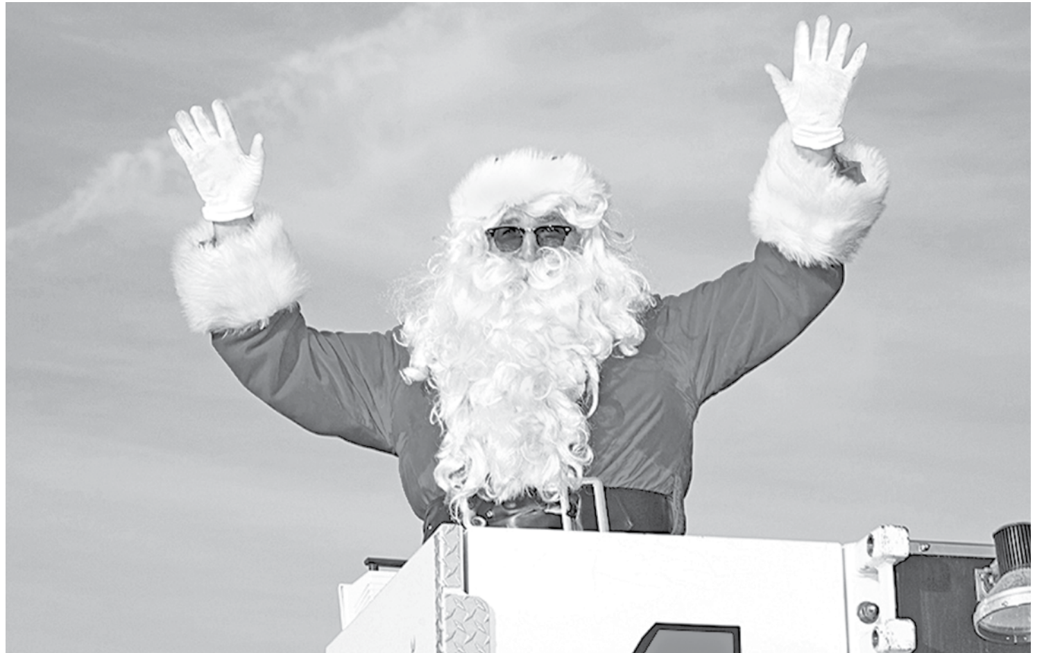
South Bay Santa wishes everyone in Hawthorne, Inglewood, and Lawndale a Merry Christmas!