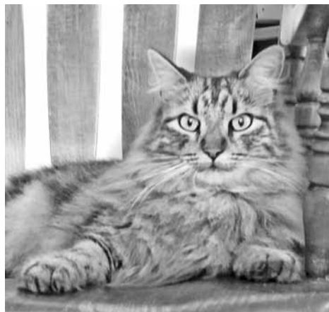
Landau would make a great 'only cat' so he can have your lap all to himself.

When you adopt a "pet without a partner", you will forever make a difference in their life and they are sure to make a difference in yours.