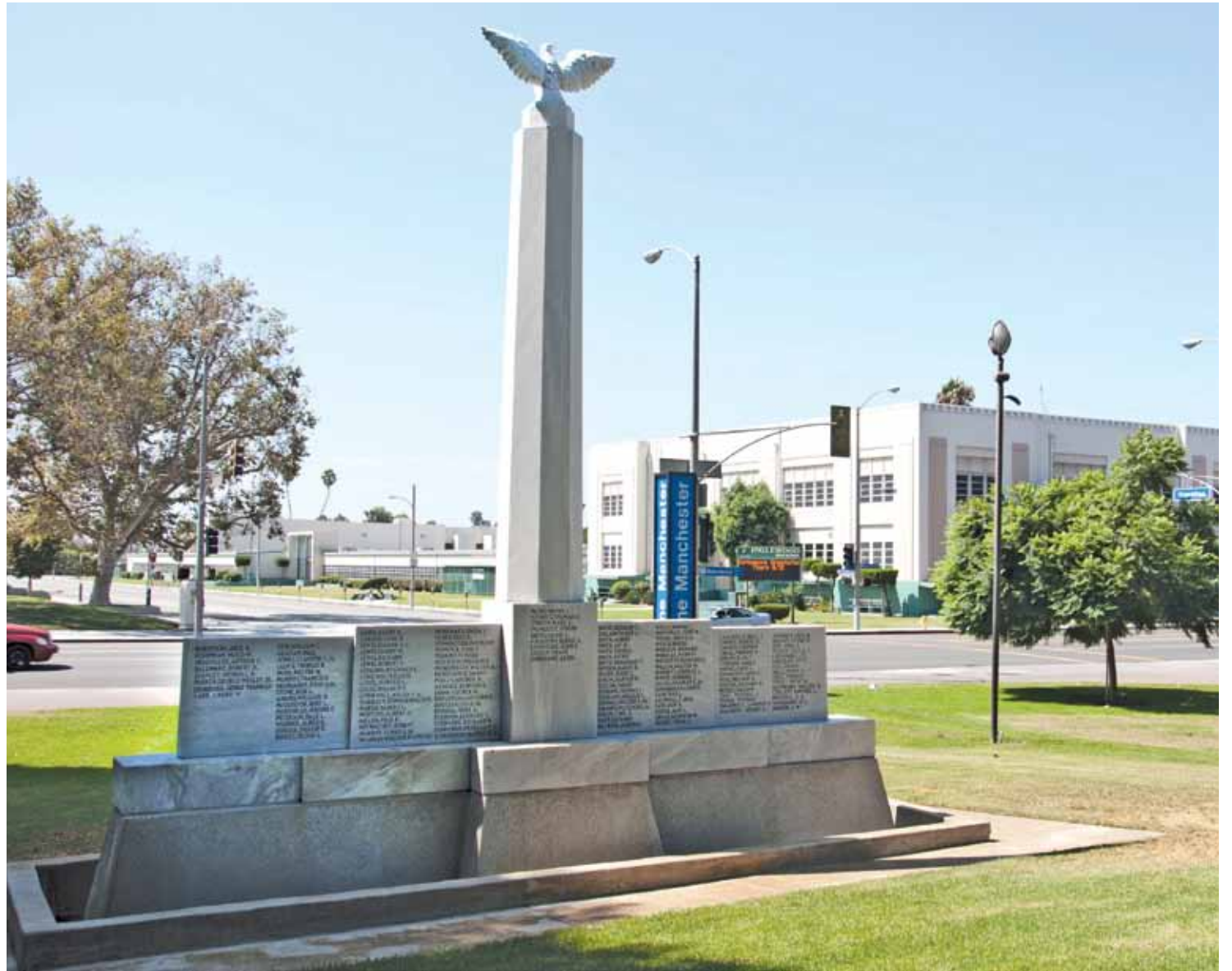
View of the Veteran's Memorial outside of Inglewood City Hall. The memorial is dedicated to the veterans who gave their lives in the Korean War, Vietnam, and World War II. The inscription says, "To Keep Forever Living the Freedom For Which They Died."