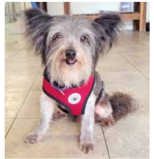
Tolkien is a polite and quiet senior dog.

volunteers had their Vet do surgery to repair my broken leg and I'm happy to report that the Vet thinks I will make a full recovery. I've been behaving myself and have been a good patient so I'm healed enough to go to my new home. I can't quite run and play as long as I'd like, but with some time, I'll be back to normal. I get along great with other dogs and I'm a real cutie. I'm also very sweet and appreciative of any and all affection. If you are interested in Wyatt, please email info@msfr.org for more information.