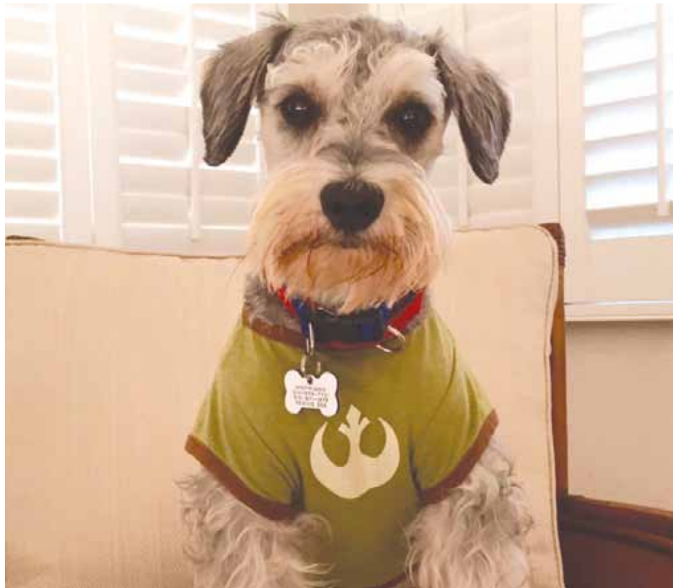
Bryan loves snuggles, massages, and fetch.

We are looking for volunteers to help with our pet adoption fairs which are held every Saturday at the Petco located at 537 N. Pacific Coast Highway Redondo Beach 90277, from noon-3:30 p.m.. If you are interested in volunteering and can commit to at least one Saturday a month, please contact us at info@msfr.org . You can also visit all of our Miniature Schnauzers & Friends rescues at the adoption fair or check out our website, www.msfr.org . If you have any questions about a particular dog's availability you can email us at info@msfr.org . Schnauzers! Bet you can't adopt just one!