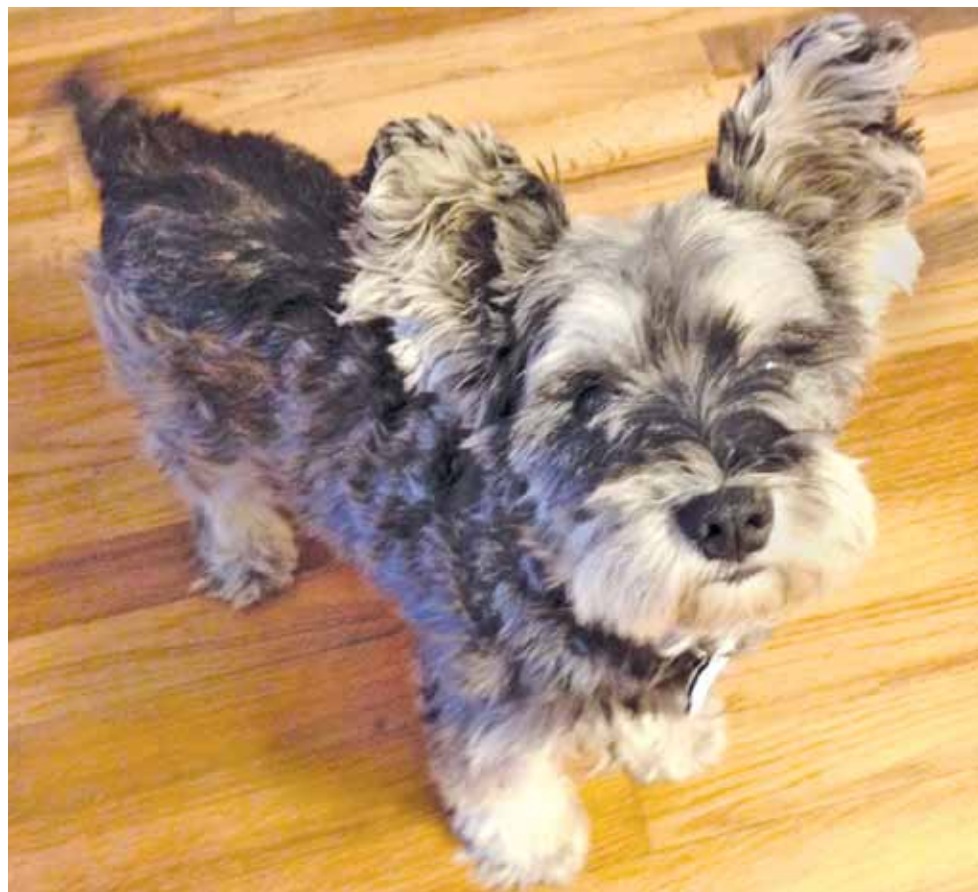
Pumpkin has been rescued and now has a new family.

Congratulations to our little Pumpkin and her new family. They are previous adopters and she is the third Schnauzer that they have adopted over the years. Pumpkin joins MSFR