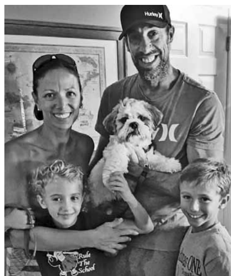
Gummi Bear and his brand new family.