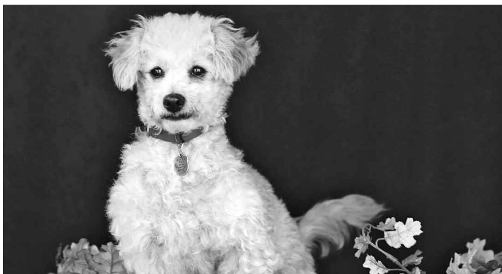
Rumba is an apricot Poodle who loves her walks and cuddles.

Adopt a "pet without a partner" and give a homeless pet a second chance in life.