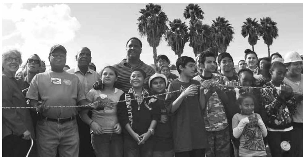
Volunteers of all sizes teamed up to make the playground a reality.