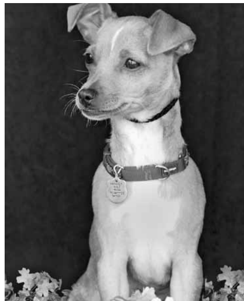
Hula is a golden, mix-breed pup who gets along with other dogs.

To learn more about these and other wonderful dogs, visit our website at www.animalsrule.org . If a dog is on our website, it's available. Come to our Saturday adoption events from 11 a.m. - 3 p.m. at 305 North Harbor Blvd., San Pedro (just off the 110 near the cruise port). We are always in need of donations for veterinarian bills and our senior dogs. Donations can be made through our website or by sending a check payable to: Animals Rule Placement Foundation at 305 North Harbor Blvd., San Pedro, CA 90731. All donations are tax-deductible; we are a registered 501©3 non-profit organization.