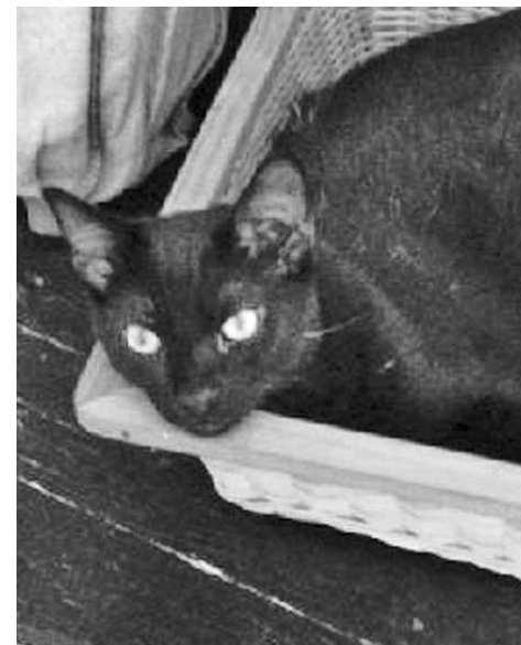
Little Ricky loves to play! He really really loves it.

Be kind. Save a life. Support animal rescue.