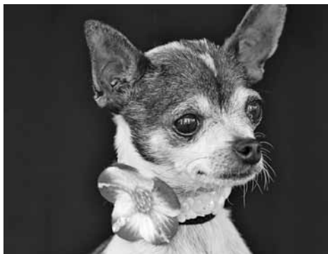
Mama Cass has a sweet and friendly personality.