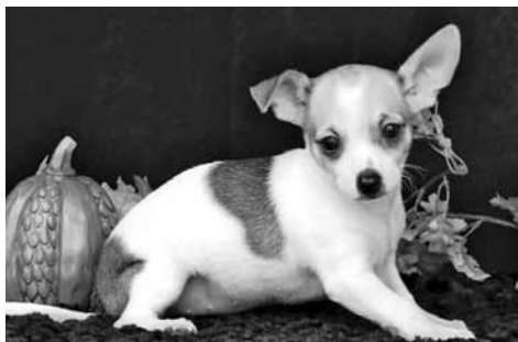
Dharma is an adorable Chihuahua pup.

Sticks were born on August 21, 2014. Their mom Mama Cass is a gem and they are the best little puppies ever. Chihuahuas are a dime a dozen these days in the shelter, but none are sweeter than these little puppies. They have been raised with a lot of tender loving care from the day they were born. Both pups can be seen by appointment only with an approved application. They are ready to go home, but will need to remain in our relative area of the South Bay or North Orange County due to our spay/neuter ordinance. (They may be adopted separately.) Both puppies will be spayed/neutered when of age, are current on vaccinations, dewormed, and will be microchipped.