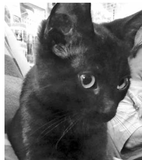
Tyrese loves his brother Troy and any other company.

These kittens are available for adoption through Kitten Rescue, one of the largest cat rescue groups in Southern California. All of our kitties are spayed/neutered, microchipped,