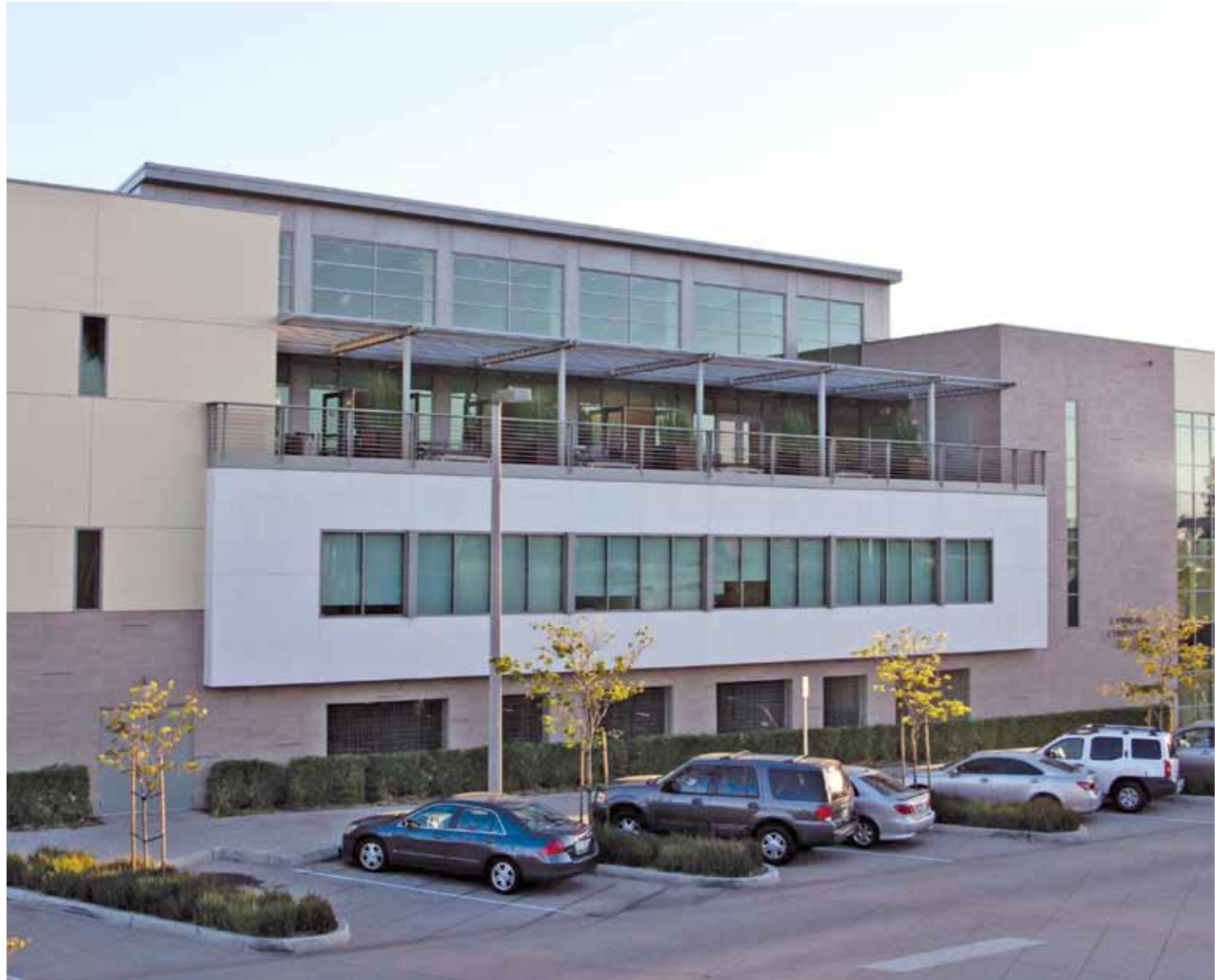
The Lawndale Community Center as seen from Hawthorne Blvd. The community center, located at 14700 Burin Ave., offers diverse services for all ages, including recreational activity, senior transportation, exercise programs, food assistance programs, and computer training.