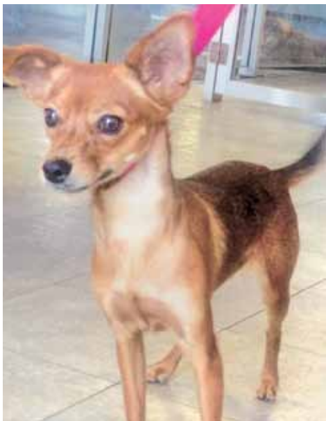
Twiggy might be a mix of greyhound, but is all happiness.

Are you looking for a delicate little deer of a dog that only weighs 4 pounds? That's me – Twiggy ! I'm an 8-month old, female, pup. Because of my slight build and LONG legs, folks think I could be an Italian Greyhound mix. I'm an incredibly happy dog who adores people and enjoys making friends everywhere I go. I'm also fearless around bigger dogs and love to play. Due to my age, I still need lots of attention and would do really well in a home with another playful dog. Twiggy can be seen anytime at Yellow Brick Road Doggie Playcare in El Segundo Call 310-606-5507. •