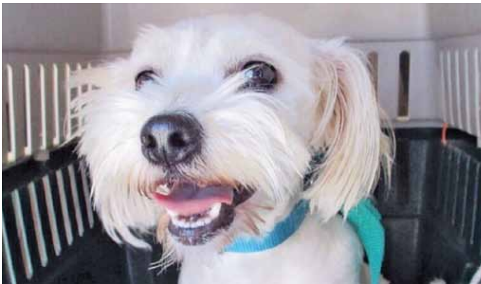
Harrison is a mini-schnauzer mix who loves other dogs.

We are looking for volunteers to help with our Saturday pet adoption events which are held at the Petco located at 537 N. Pacific Coast Highway Redondo Beach 90277. If you are interested in volunteering and can commit to at least one Saturday a month, please contact us at info@msfr.org