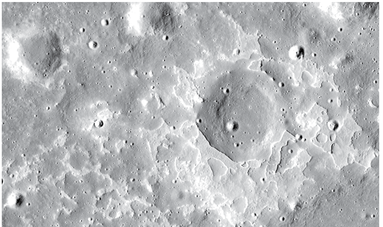
Scientists have identified a new lunar feature called Maskelyne, one of many irregular mare patches, or "young" volcanic deposits, that are the result of basaltic eruptions that occurred "recently"; that is, less than 1 – 1.5 billion years ago.