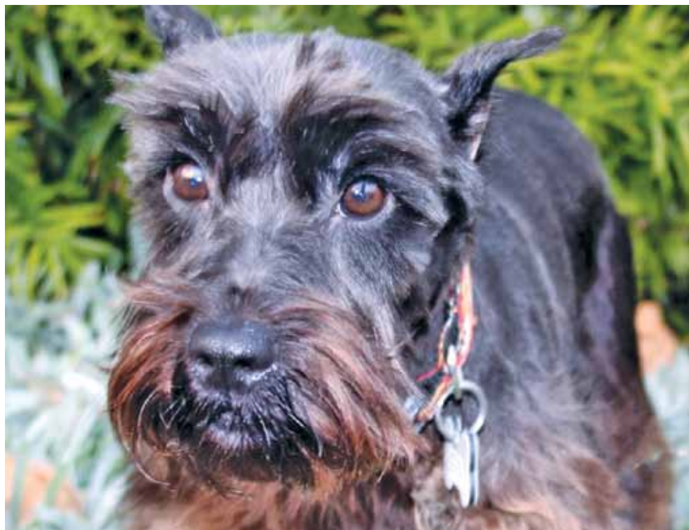
Evie is a happy girl with a new home.

If you have any questions about a particular dog's availability you can email us at info@msfr.org . Please visit all of our Miniature Schnauzers & Friends rescues at the adoptions fair held every Saturday from noon-3:30 p.m. or check out our website, www.msfr.org . Our adoptions fairs take place at Petco, 537 N. Pacific Coast Highway, Redondo Beach, California. Schnauzers! Bet you can't adopt just one! •