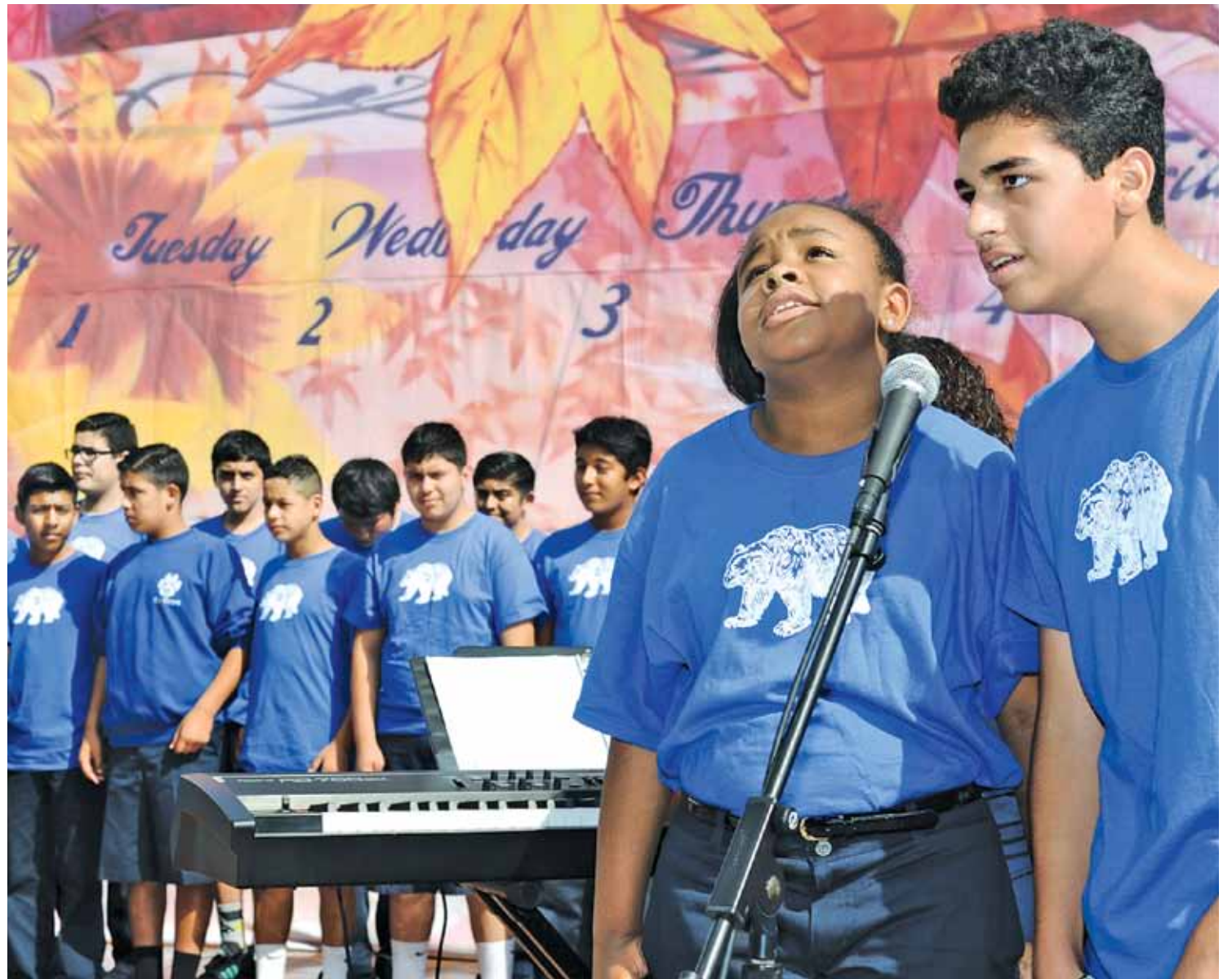
Students from Century Community Charter perform at The Music Center's 36th Annual Very Special Arts Festival. Students participating in the festival worked hard from the start of the school year to prepare for their involvement. They created a performance or submitted artwork around the festival theme, "A Year to Remember." The free festival welcomed more than 2,000 K-12 students with disabilities and their mainstream peers from all over Los Angeles County to share their artistic achievements in both visual and performing arts.