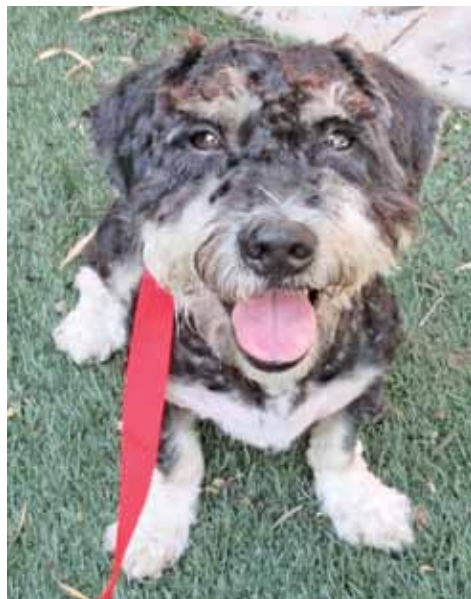
Randall is happy-go-lucky and fun to be around.

If you're looking for a 2-year old, male schnauzer/cocker/poodle mix then I'm your guy. I'm Randall and my breed is anyone's guess. Some folks say because I'm stocky, 20 pounds, and built low to the ground that look like a mini Petit Griffon