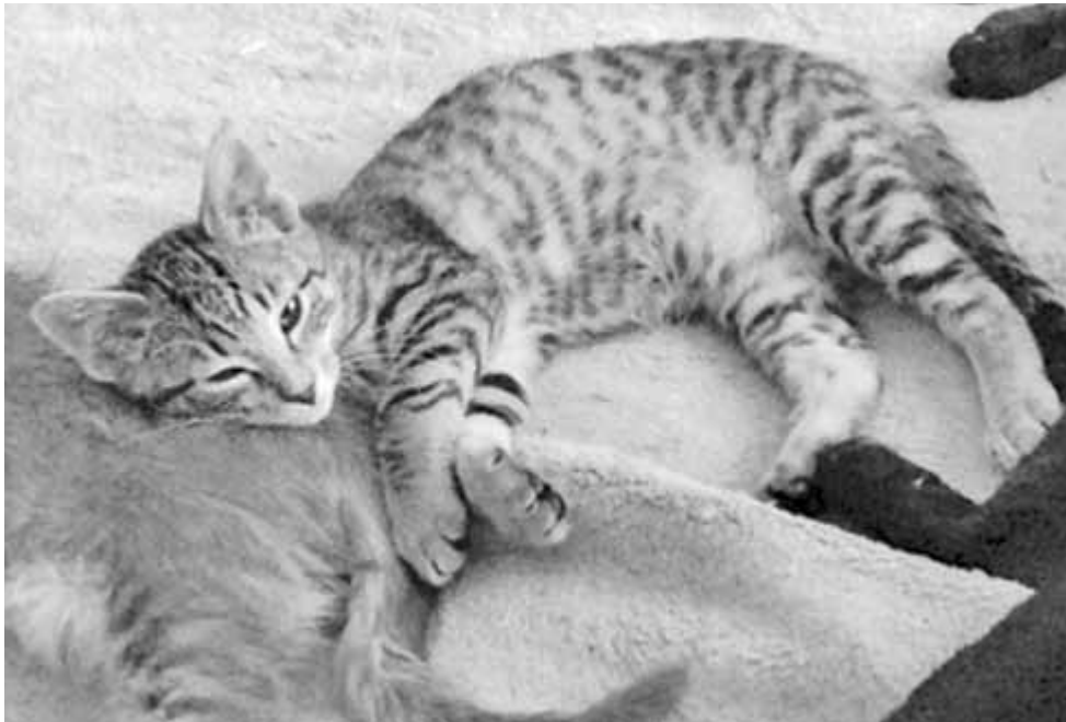
Kiki is looking for a home with another kitty to play with.

Looking for your purr-fect match? Kitties of all colors and sizes are ready for the forever home with you. Mark your calendar now and join us for our 7th Annual Fur Ball, Sunday, October 4, 6 pm. It will be a magical evening, benefitting the forgotten felines of Los Angeles. More information and tickets are at our website, www.kittenrescue.org .