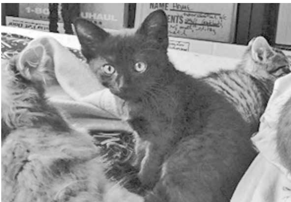
MySin is elegant and intelligent.

Be kind. Save a life. Support animal rescue.