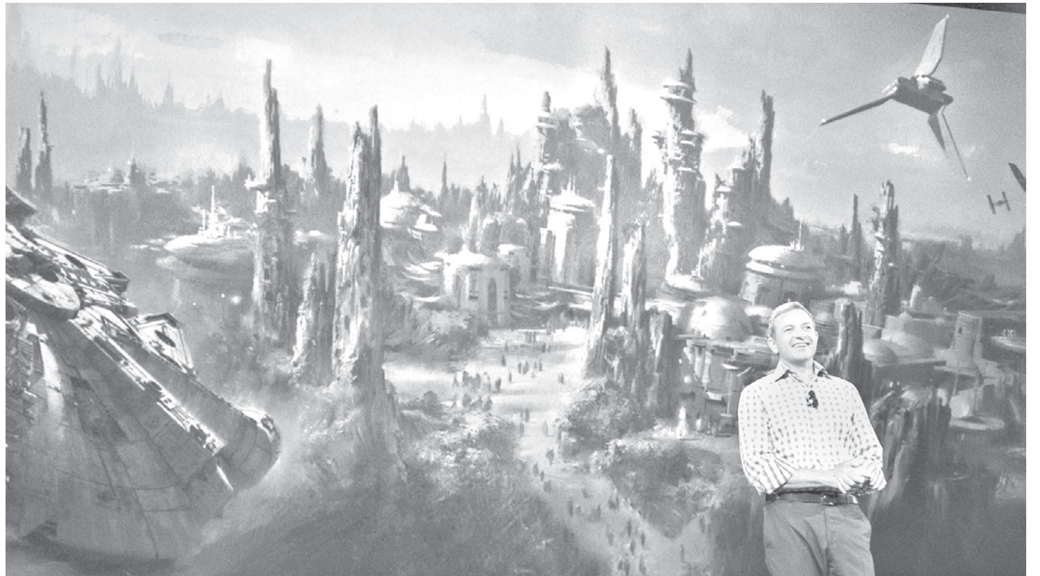
Walt Disney Company Chairman and CEO Bob Iger announced at D23 EXPO 2015 that Star Wars-themed lands will be coming to Disneyland park in Anaheim. These authentic lands will have two signature attractions, including the ability to take the controls of one of the most recognizable ships in the galaxy, the Millennium Falcon, on a customized secret mission, and an epic Star Wars adventure that puts guests in the middle of a climactic battle.