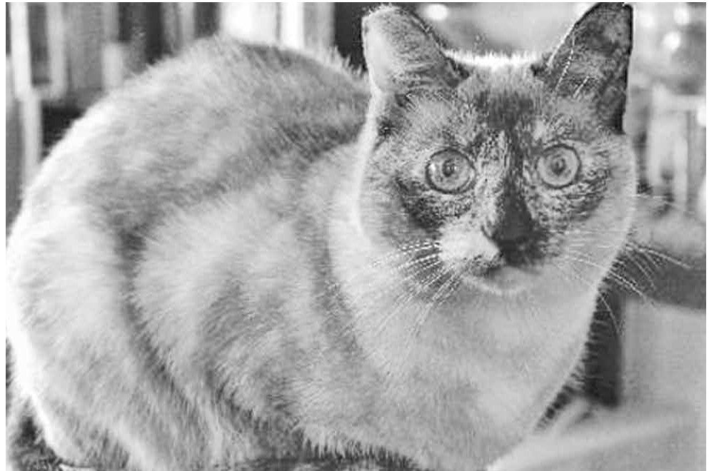
Lena enjoys comfort and security.

his special skills to make biscuits on you when you're lying down, MySin is ready to give you his love.