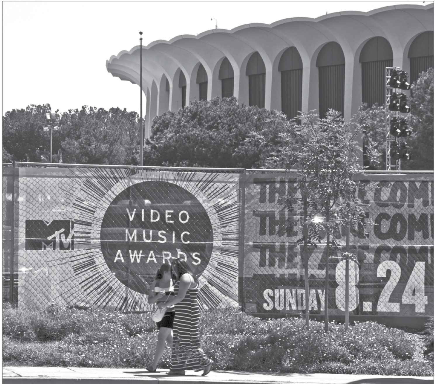
Inglewood residents pass the advertisements for the MTV Video Music awards, held August 24 at the Forum in Inglewood.