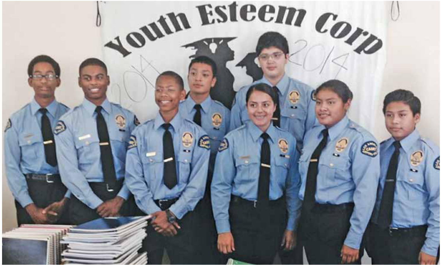
Los Angeles Airport Police Youth Cadets participated in the third annual Backpack School Supply Donation Drive hosted by the Youth Esteem Corporation (YEC). Together, the Youth Cadets, the Airport Police, and YEC provided school supplies for over 200 at-risk children in the Los Angeles area.