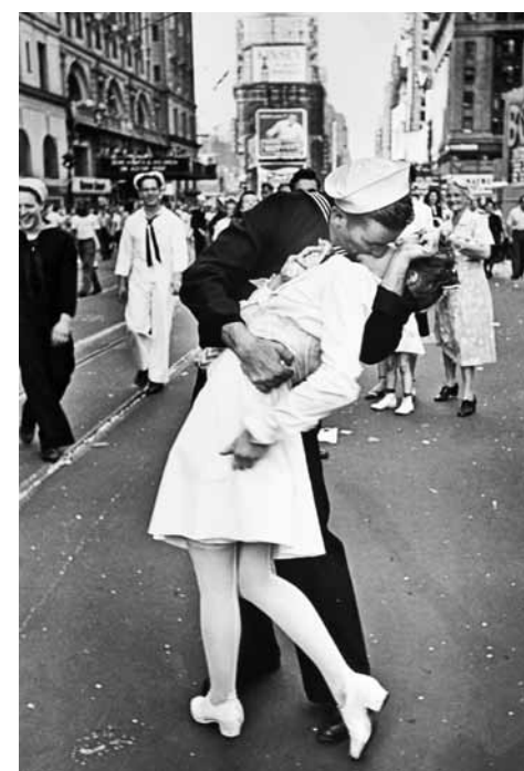
Alfred Eisenstaedt's photo 'V-J Day in Times Square' captured the fervor and passion of the war's end. Many people have come forward claiming to be the sailor or the woman in white; scientists have used astronomy, historical detail, and shadows to help rule out some of those claimants. Photo by Alfred Eisenstaedt.

In 2014, a small planet was discovered around Alpha Centauri B. Unfortunately, this exoplanet is ten times closer to the star than Mercury is to the Sun, so its surface is melting under the stellar heat, and it probably has no atmosphere. At a distance where planets like Earth with liquid water on their surface could exist (the "habitable zone"), no planets have been found as yet, but scientists are continuing to search for one. If such a planet is found, or even