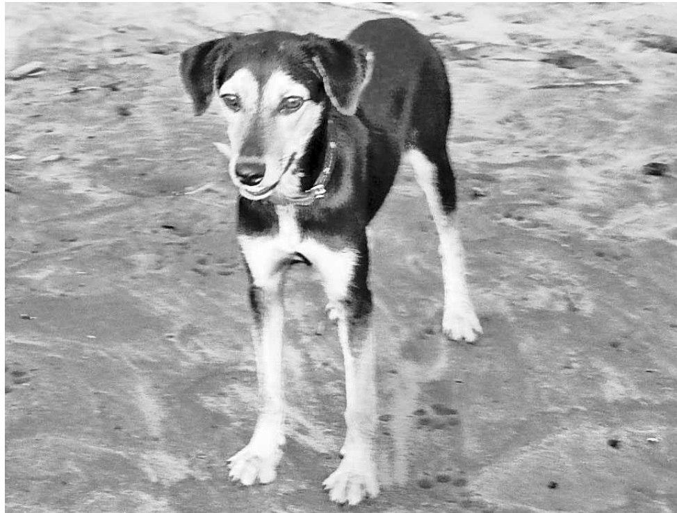
Ginny looking gorgeous

Please help Ginny! Ginny is a Zaguato (Costa Rican Street Dog) looking for a forever home. She is approximately 18 months old, and weighs about 25 lbs. Her owners handed her over to us to foster her, because they no longer wanted her. She was tied up outside with a wire collar that became embedded in her neck while suffering in the hot Costa Rican sun with no food or water. She was very sick when we got her 9 months ago,