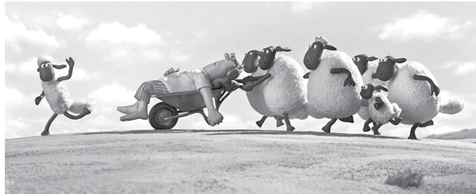
Shaun the Sheep Movie.

The new film is a short but sweet delight, and the key to its charm is its absolute simplicity. That's not to say the film is minimalist, per se; Aardman's signature stop-motion animation has never looked better or more detailed. But one example of the skillful straightforwardness is the taciturn sound design, in which the characters only speak gibberish. A bizarre creative choice that somehow works - demonstrating how unnecessary words are in such a medium as inherently visual and ornate as the animated