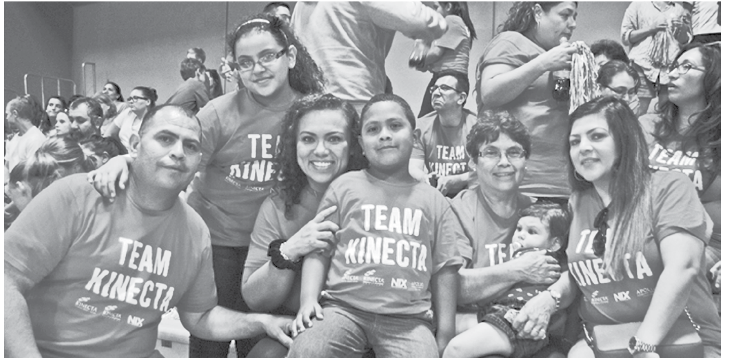
More than 300 Kinecta members, employees, family and friends enthusiastically participated as spectators and supporters of the Special Olympics World Games in Los Angeles. During Kinecta's 75th Anniversary Celebration on July 11, "Reach Up," the Special Olympics World Games theme song, was performed by a group of young athletes slated to participate in the Opening Ceremony.