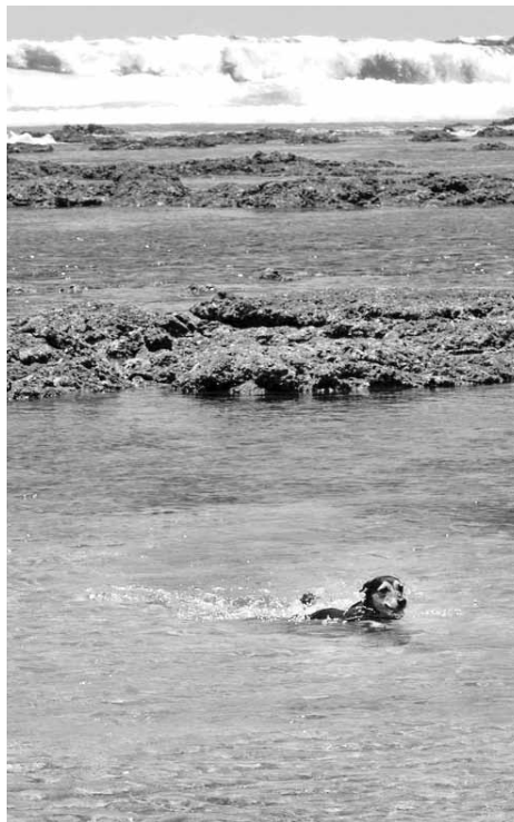
Taking a swim.

Ginny is completely house broken, extremely smart, a quick learner, and is not a chewer. She loves to go to the beach, on car rides, walks or hikes. She is great off the leash! She swims in the ocean, so I'm sure she'd love the pool too. Ginny is very loyal, she loves dogs, cats and kids! Shy at first, but warms up quickly. She is not a