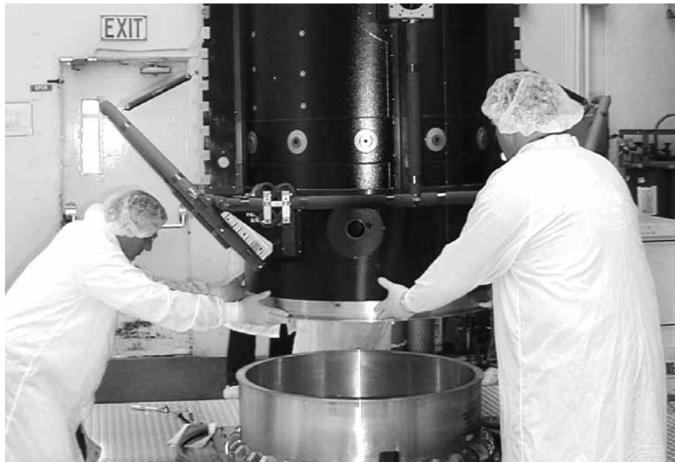
The Dawn Spacecraft being assembled. Dawn was made to orbit the large asteroid Vesta and the dwarf planet Ceres, and was launched in 2007. It has since sent back enough data that scientists can map the surface of Ceres.

The newly labeled features include Occator, the mysterious crater containing Ceres' brightest spots, which has a diameter of about 60 miles and a depth of about 2 miles. Occator is the name of the Roman