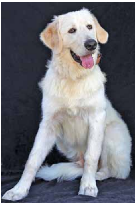
Bear is learning to play and eat and play some more.

Since she is one of the sweetest dogs in the world, we named her Lovey . She is a fantastic little lap dog who is 1-2 years old and weighs only 8 pounds. Lovey is completely housebroken, uses a doggie door, and is great on the leash as she walks up to 4 miles a day in her foster home. She is completely cat safe, loves to play with plush toys and is fine with children. Lovey has good play manners with all other dogs. She is very sweet and quite smart. With her cheerful personality and non-stop wagging tail, she will bring an abundance of love and sunshine into any home. Lovey is spayed, current on vaccinations, microchipped, fine with other dogs and cat safe.