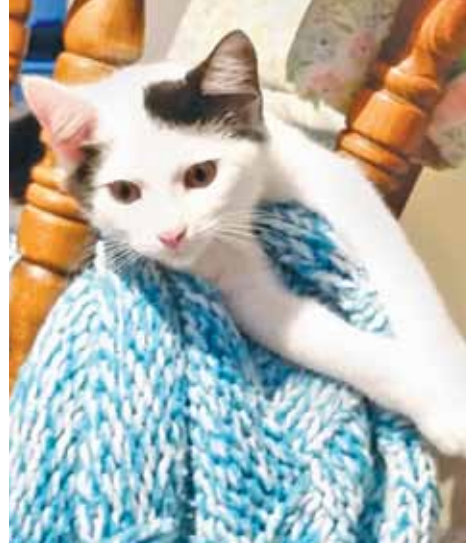
Brady is independent, but also kind and loving.

Saving one animal won't change the world, but the world will surely change for that animal. •