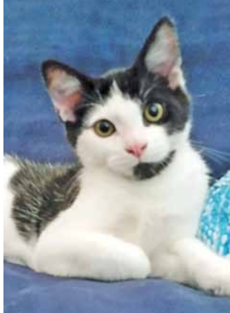
Elliot is an energetic kitten with a great purr.

Three adventurous little kittens are ready to be your new best friend and your purrfect partner. They love to chase balls, roll and wrestle together, and are always ready to play with the feathers and strings their foster mom dangles for them. They would enjoy finding homes together or can be adopted separately into homes which have another friendly kitty as a playmate. Come meet brothers Brady and Elliot and their foster sister Eliza!