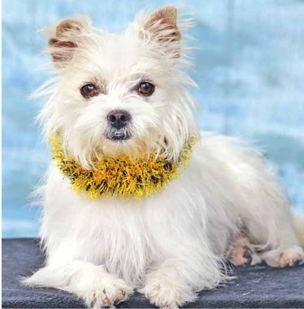
Lovey is cheerful – and housebroken.

Adopt a “pet without a partner” and give a homeless pet a second chance in life.