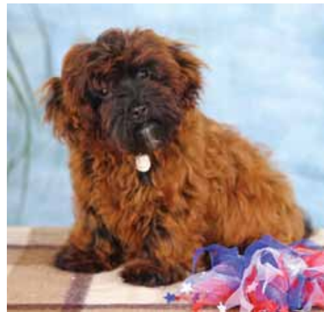
Lucille is a “Morkie” – half Maltese and half Yorkie.

Lucille is a little ‘Morkie’ - half Maltese and half Yorkie. This is the most original looking dog we have seen in a while and is simply adorable! Lucille is doing great with housebreaking and is almost there. She settles into a routine quite easily. She is energetic, good with other dogs and will be fine with cats. No apartment living for this one; we will need you to be a homeowner. Lucille