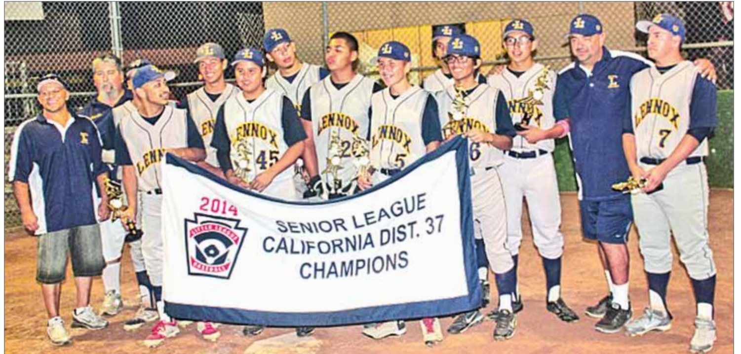
Lennox came from behind to top Tri Park 11-9 for the District 37 Senior Little League All-Star championship last Saturday at Jim Thorpe Park in Hawthorne. Lennox is playing in the Section 4 Tournament at Marine Park in Manhattan Beach this week.