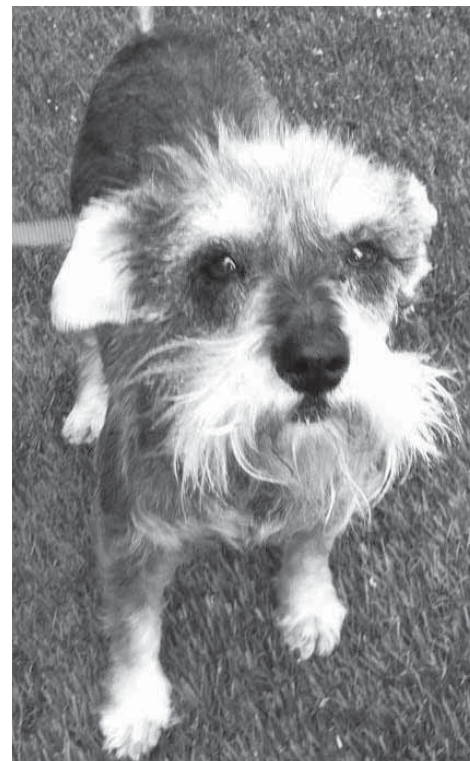
Gladys is another rescue dog who needs someone to care for her.

If you've never seen a male Catahoula Leopard Dog mix pup you must come see me. My name is Earl . I'm 5.5 months old and quite a handsome guy. Based on my current weight of 30 pounds, I will probably be 50-60 pounds when I'm fully grown. I was rescued from a crowded LA County shelter where I came in as a stray. Like most large breed puppies, I am pounds of play, curiosity, energy and affection...plus a few ounces of common sense! I am very intelligent and have lots of potential. I am already crate-trained, virtually housebroken and I have no obnoxious habits. I have begun a basic training program and am ideal for an adopter who welcomes the opportunity to shape a pup into an adult dog to be proud of. I am a determined youngster who figures out what I am supposed to do a lot quicker than I actually do it, so my adopter should be aware that obedience training is a must. That