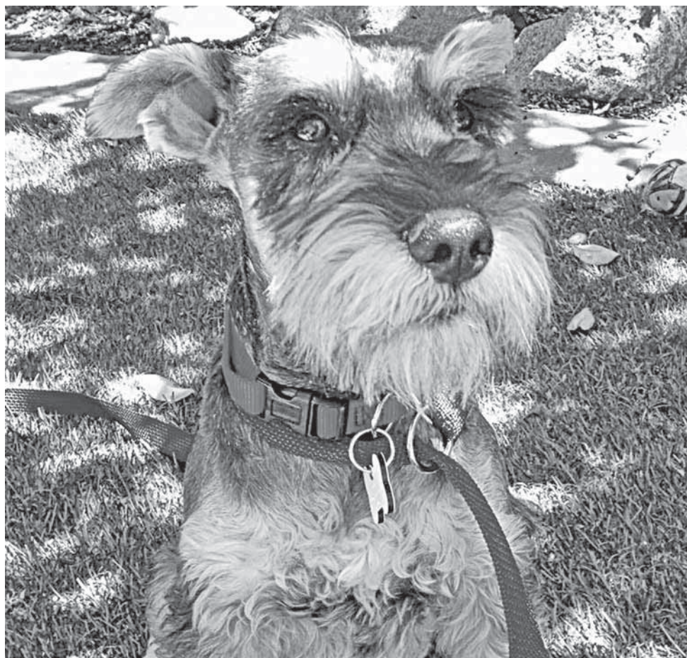
Avery has a happy new home with a schnauzer-loving family.

Congratulations to Avery , our Downey shelter rescue from mid May, and his new family. Avery is living in Cypress and has an 8-year old Miniature Schnauzer sister. His new folks are long time schnauzer lovers who lost their 16.5-year old schnauzer last year. We wish all of you a world of happiness!