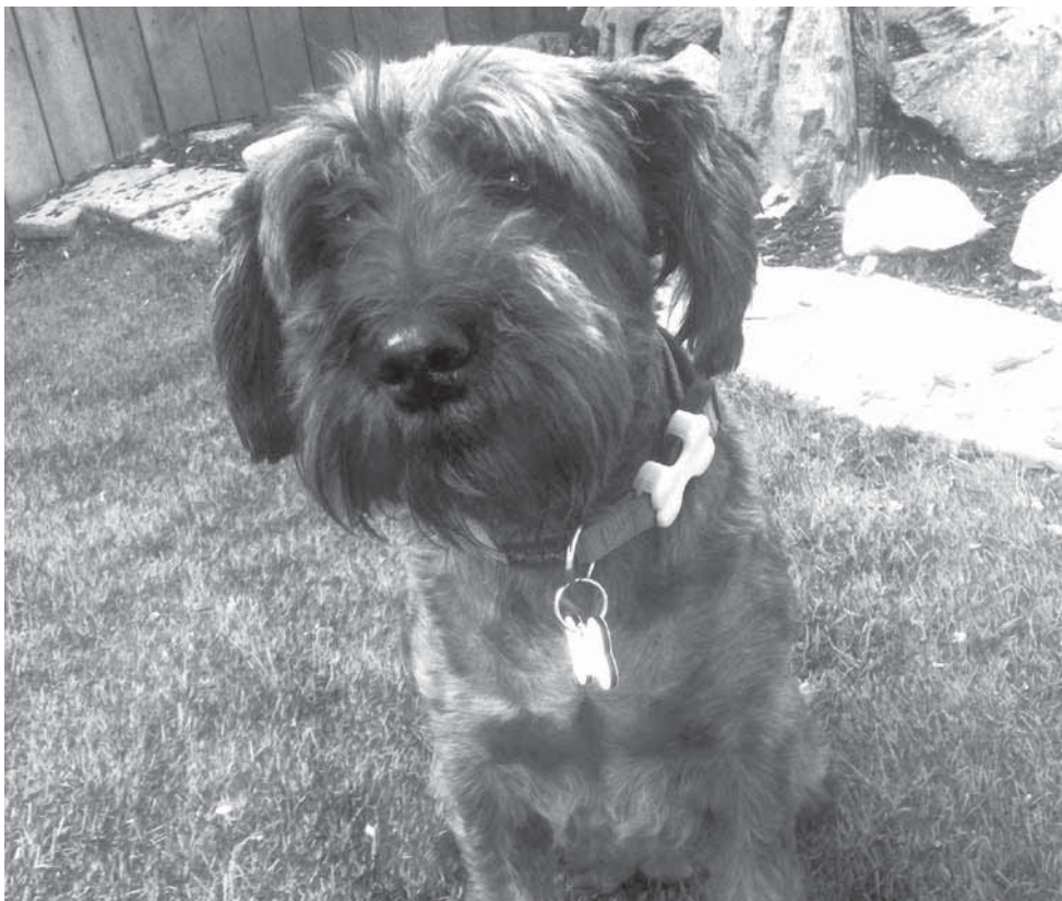
Kayle is a purebred miniature schnauzer who needs a loving owner.

We are looking for volunteers to help with our Saturday pet adoption events which are held at the Petco located at 537 N. Pacific Coast Highway Redondo Beach 90277. If you are interested in volunteering and can commit to at least one Saturday a month, please contact us at info@msfr.org