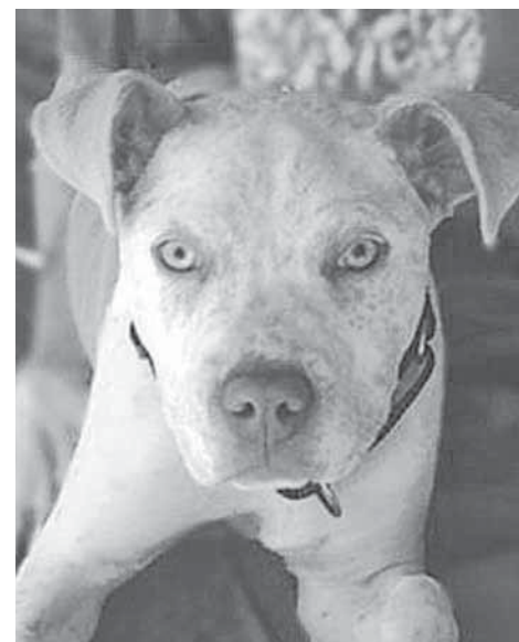
Earl is a Catahoula Leopard Dog mix – a big, exuberant boy!

said, large-breed puppy experience is a big plus. I am an excellent choice for an active family; like other working breeds Catahoulas are happiest when kept busy. If you would like to meet Earl, please email emread@verizon.net for more information. •