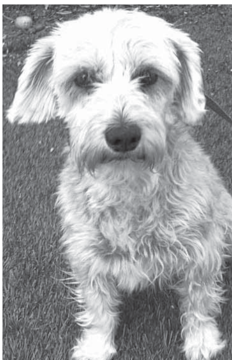
Tabitha is a schnauzer mix who was rescued from an LA City shelter.

My name is Kayle and so far I've had a most interesting life. I'm a 3-year old, female, purebred Miniature Schnauzer. My previous owner, who was in trouble with animal control for having too many dogs, surrendered me to MSFR. Those great folks took me in even though I was VERY pregnant. I had excellent care and had a litter of five darling pups on March 30th. All of my kids have homes awaiting them but now I am looking for a loving, stable, forever home. I've lost most of my "baby" weight, am back to 17 pounds and would make a fabulous companion. I get along splendidly with other dogs but also appreciate peace and quiet time. If you are interested in Kayle, please email info@msfr.org for more information.