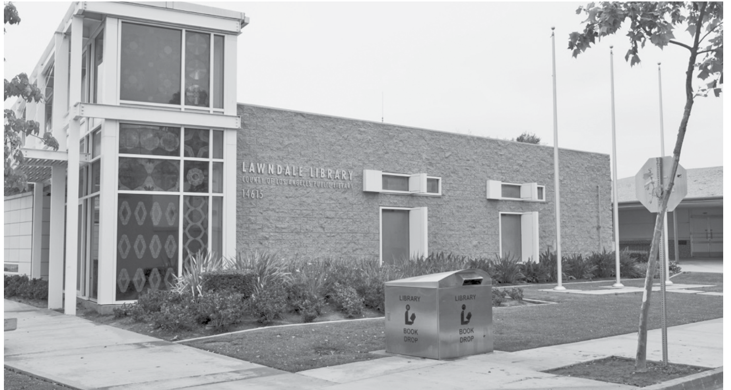
A great place to take the kids in summertime is the Lawndale Public Library at 14615 Burin Avenue, open Tue-Wed 1-8pm, Thu-Fri 11-6, and Sat 10-5. To see a list of events and programs at the library, visit http://www.colapublib.org/lib/lawndale/index.php.