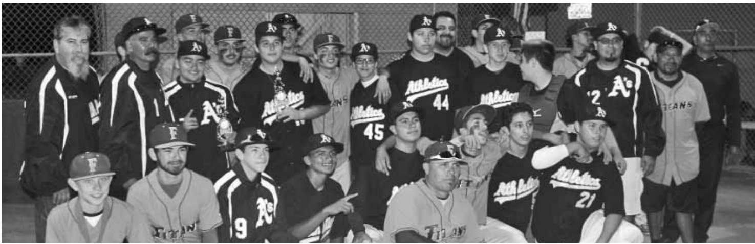
The Carl Magee, Jr. Senior Little League Baseball Tournament of Champions champion Lennox Athletics and runner-up Lennox Titans pose together after the A's downed the Titans 10-4 for the title Saturday at Jim Thorpe Park in Hawthorne.