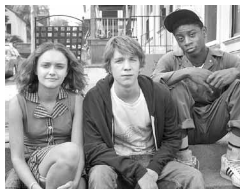
Olivia Cooke, Thomas Mann, and RJ Cyler in Me and Earl and the Dying Girl.

It's hard to deny the power of the two anchoring performances in Me and Earl and the Dying Girl —those of Thomas Mann, or Me, and Olivia Cooke, or the Dying Girl. Mann plays Greg, a reserved teenager whose high school life depends on a carefully cultivated neutrality and lack of involvement, soon threatened when his mother decides he should befriend an ailing classmate he barely knows. So we meet