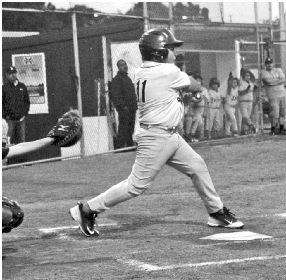
A Lennox Tiger batter takes a swing at a pitch during a Carl Magee District 37 Tournament of Champions game against the Westchester Yankees on Friday.