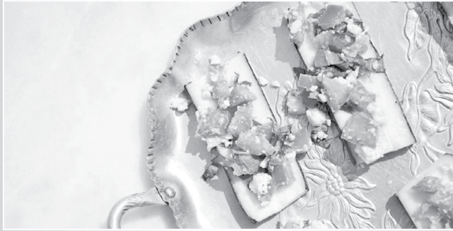
Makes 6-8 servings