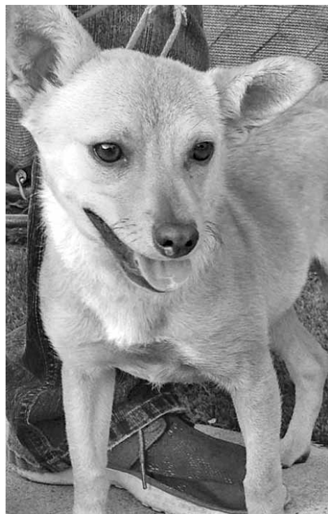
Stuart Little is a joyful, fun-loving guy.

Hello – my name is Stuart Little . I am a two-year old male terrier mix who will steal your heart. I was rescued from a high-kill shelter in San Bernardino after what is considered a lengthy stay of three weeks. My personality and temperament made me stand out and I became a shelter favorite in no time. I really am a joyful, sweet, fun-loving guy. Everyone loves me and I love everyone. I'm very friendly with people and I get along great with other dogs - both large and small. I've got lots of energy and like to play but I also love to lie quietly in a lap to be petted. I'm only 14 pounds and full grown so I won't outgrow your lap and I'm a great cuddle bug! I travel well in the car and I'm crate trained so what more can you ask for? Stuart Little can be seen anytime at Yellow Brick Road Doggie Playcare in El Segundo Call 310-606-5507 or email southbaydoggie@hotmail.com for appointment. •