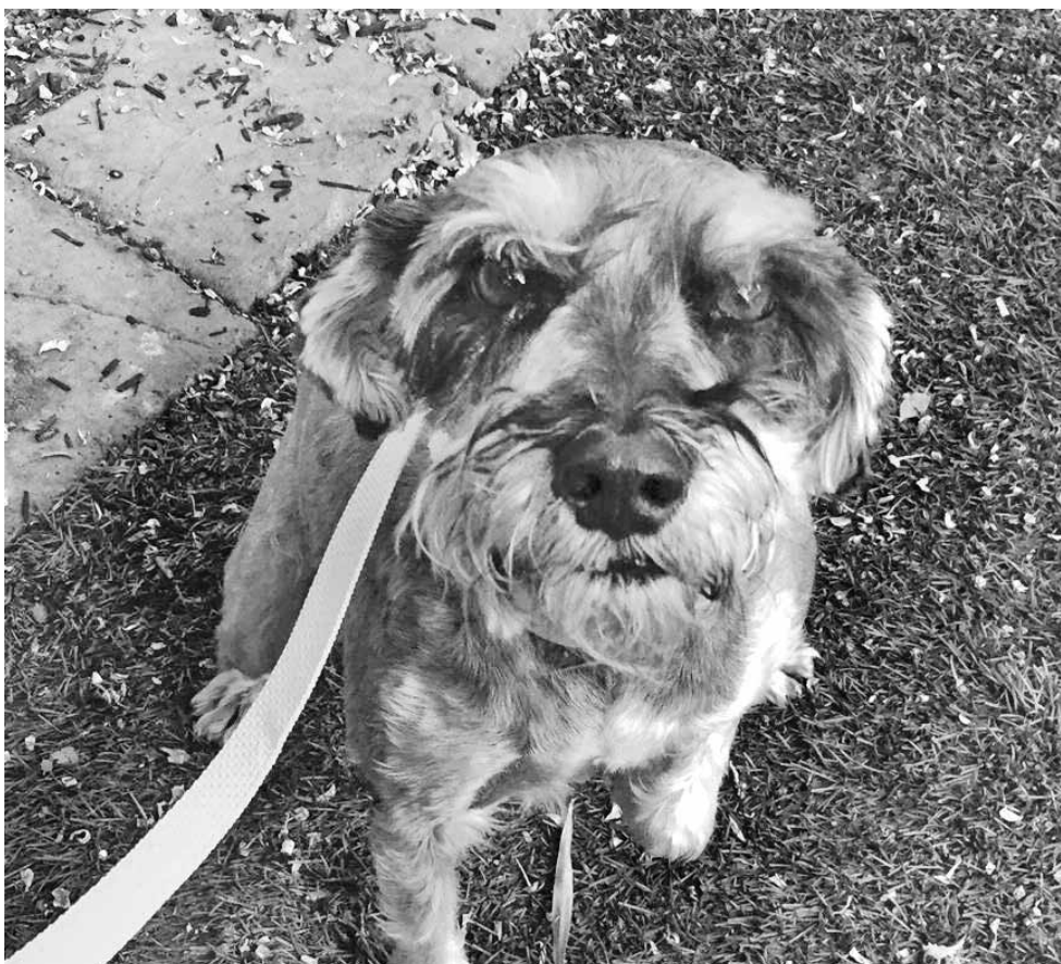
Farley has found a new home with many new Schnauzer friends to play with.

Congratulations to Farley and his new family. Farley is the 4-year old male Miniature Schnauzer who has "cauliflower ears" due to untreated hematomas. His new family includes a 15-year old Miniature Schnauzer, and two boys to call his own! We also learned that other family members have Schnauzers so