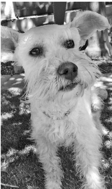
Icey has a beautiful ice-white coat.

We are looking for volunteers to help with our pet adoption fairs which are held every Saturday at the Petco located at 537 N. Pacific Coast Highway Redondo Beach 90277, from noon-3:30 p.m. If you are interested in volunteering and can commit to at least one Saturday a month, please contact us at info@msfr.org . You can also visit all of our Miniature Schnauzers & Friends rescues at the adoption fair or check out our website, www.msfr.org . If you have any questions about a particular dog's availability you can email us at info@msfr.org . Schnauzers! But you can't adopt just one!