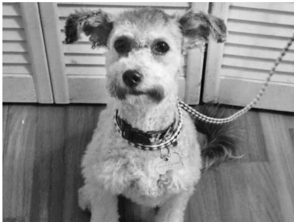
Arabelle is a petite Schnauzer/Poodle mix.