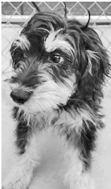
Newman is a Cocker/Schnauzer mix.

Please, let me introduce myself. I am Arabelle and if you're looking for a petite, 13-pound Miniature Schnauzer/Poodle mix I am your girl. I'm fully grown at three years of age so I will always be the perfect size for your lap. I am a bit shy and I prefer a quiet home without a lot of chaos. I was adopted in 2013 by a nice couple and while