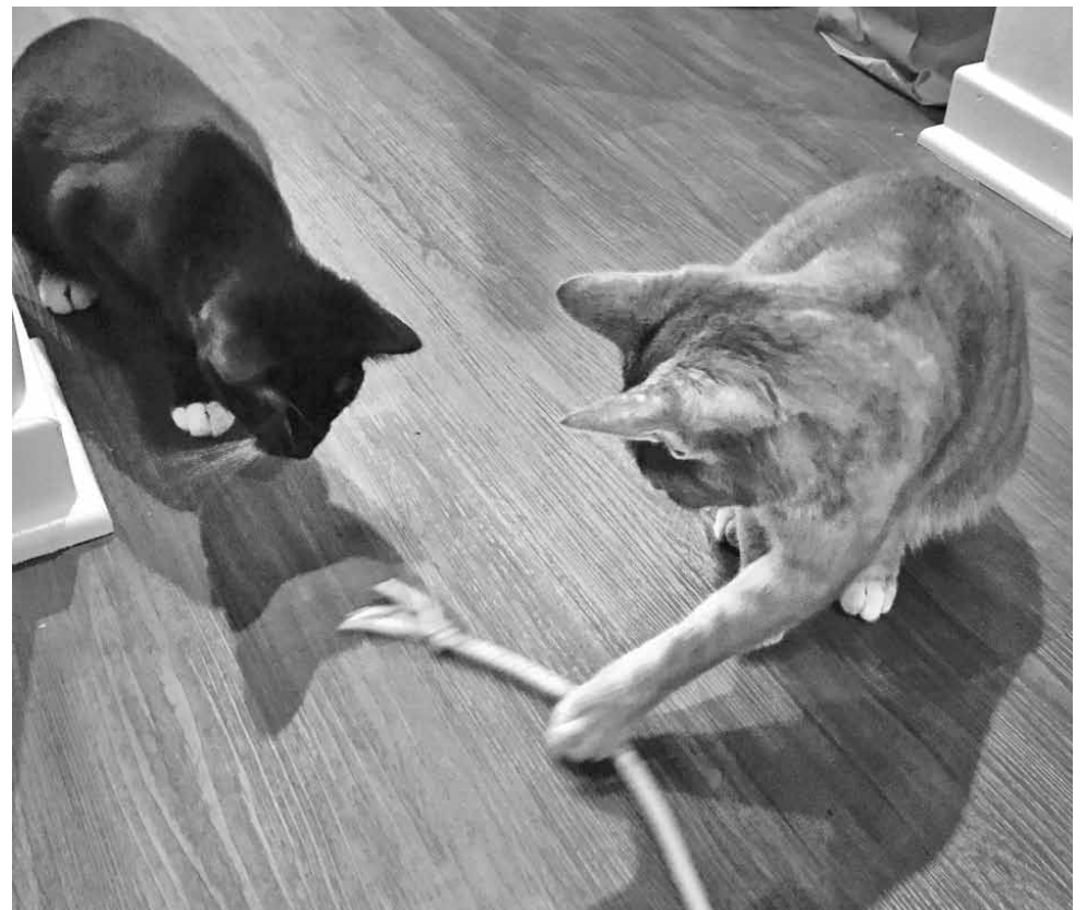
Margot (left) and Aurora are new besties.

When you adopt a "pet without a partner," you will forever make a difference in their life and they are sure to make a difference in yours. •