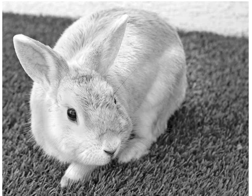
Donate your leftover greens to the SPCA and feed cute bunnies like Simba.

For questions or further information, call the SPCA at (310) 676-1149.