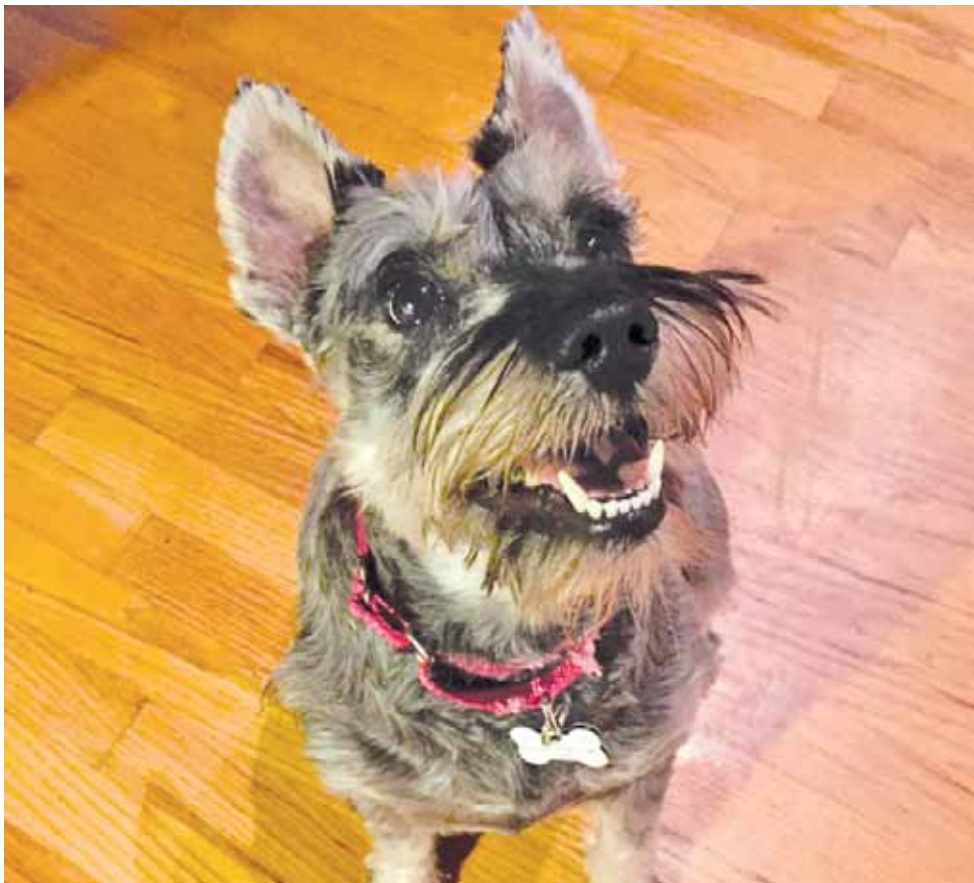
Suzy-Q is now the ruler of the roost in her new Cypress home.

Congratulations and much happiness to our gal Suzy-Q and her new family. Suzy is the little five-year old girl who had bladder stones that was rescued in January. Her Mom always had larger dogs but now she lives in a