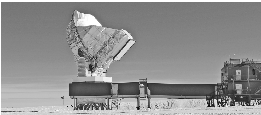
The 10-meter South Pole Telescope, at the National Science Foundation's Amundsen-Scott South Pole Station, joined the global Event Horizon Telescope array in January.

The EHT is an array of radio telescopes connected using a technique known as very long baseline interferometry, or VLBI. Larger telescopes can make sharper observations, and interferometry allows multiple telescopes to act like a single telescope as large as the separation—or “baseline”—between them. “Now that we’ve done VLBI with the