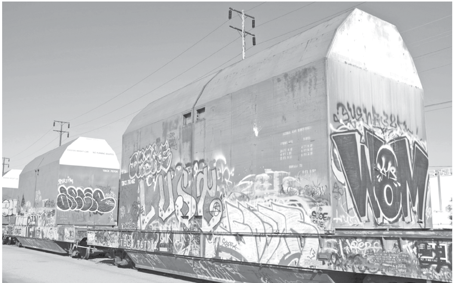
Taggers have made their marks on the stolid rail cars that service the manufacturers along Jack Northrup Avenue.