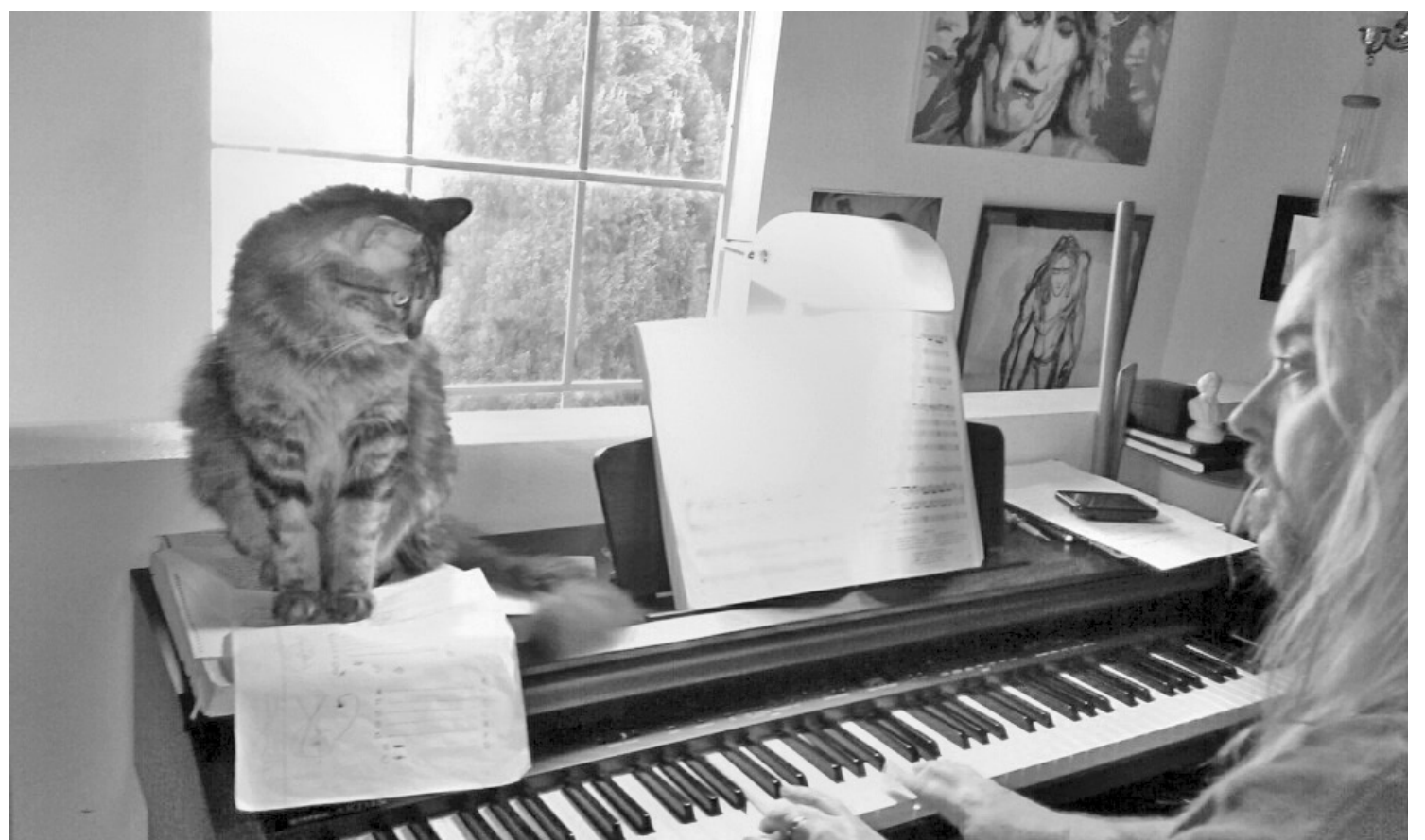
Landau has found the perfect new family to help him adjust.

Landau was initially a little too rough with his new family, not quite sure what this new transition would bring. But with every passing day and his family's patience, he is settling into his true self, letting go of his built-up anxiety from being shuffled around and having to be around so many different cats. His family loves him and are so incredible in working with him! When Landau got excited, he would sometimes stalk and attack them. But they found just blowing in his face or throwing a toy to distract him, it immediately dissipated his energy, settling him right down into a normal kitty. Each day, Landau continues to unwind more and more. His family truly loves him to pieces. Congratulations, Landau on your purr-fect match! •