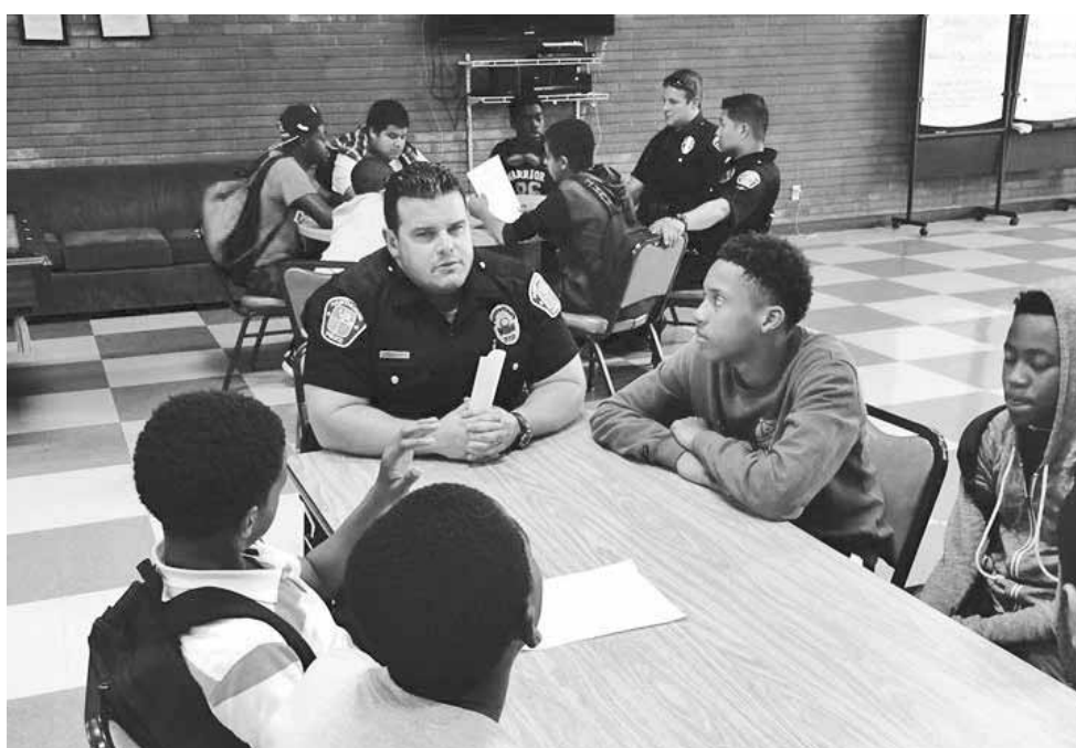
Hawthorne Teen Center hosted its first Student-Police Dialogue Program March 25, 2015, for area youth ages 13-18. Pictured is a Hawthorne Police Officer answering youth questions in a small informal breakout session during the event.