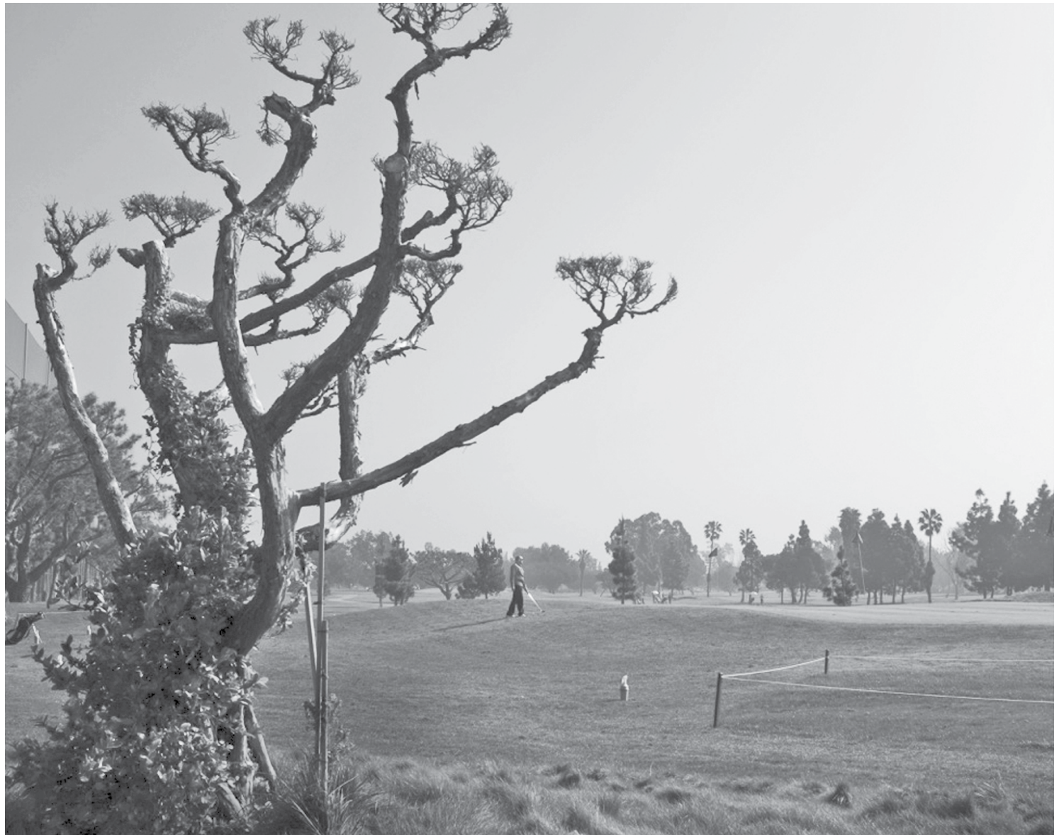
Midday golfers out to lower their score at Lawndale's Alondra Golf Course.