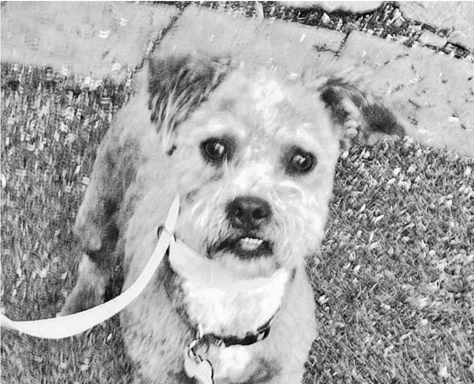
Spock is a sweet and playful friend.

We are looking for volunteers to help with our pet adoption fairs which are held every Saturday at the Petco located at 537 N. Pacific Coast Highway Redondo Beach 90277, from noon-3:30 p.m.. If you are interested in volunteering and can commit to at least one Saturday a month, please contact us at info@msfr.org . You can also visit all of our Miniature Schnauzers & Friends rescues at the adoption fair or check out our website, www.msfr.org . If you have any questions about a particular dog's availability you can email us at info@msfr.org . Schnauzers! But you can't adopt just one!