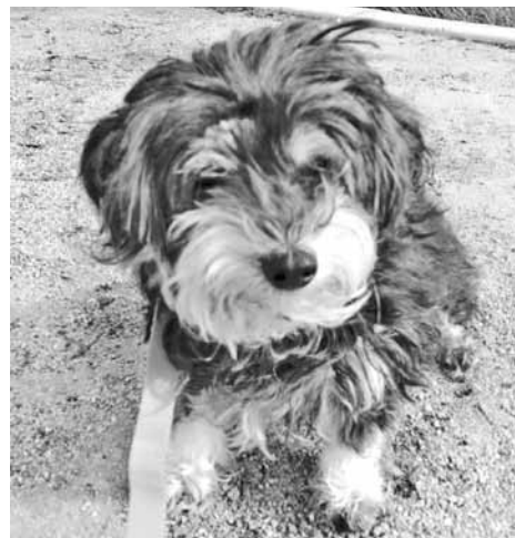
GiGi is friendly but timid.

Hi there - I'm Kendell and I hope you don't believe in "re-gifting" because my previous owners certainly did. After receiving me as a gift five years ago, they dumped (their idea of re-gifting) me at a LA city shelter. Since they never had time for me, I spent most of my 8-year life living outside and neglected. I'm only 11 pounds but should be closer to 15. I had a mammary tumor, which could have been prevented if I had been spayed, and I needed a dental too. The shelter took care of spaying me and the MSFR doctor removed my tumor when they did my dental so I'm ready for my forever home. I need some work on housebreaking because I never learned what that meant. If you have another dog that would be great because I get along with other dogs and maybe I could learn more about housebreaking! I don't want to be anyone's gift again but I do, want to be someone's loyal, lovable, companion and family member. Please see for yourself what a great gal I am. If you are interested in Kendell please email info@msfr.org for more information. •