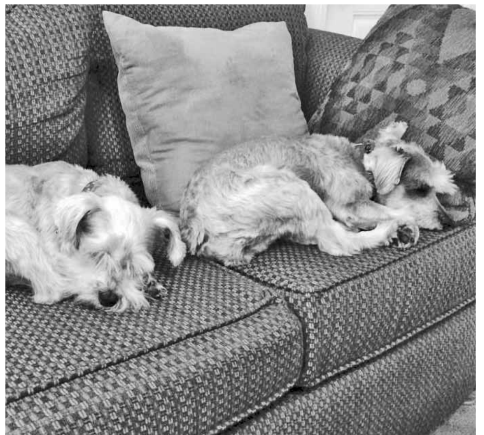
Cora and Nora got to stay together with their new family.

wanted another pair. Ironically, they planned to name one of the dogs Cora so when they met the ladies at adoptions it was Kismet. They were so surprised we had a Cora that taking Nora, now named Lucy, was icing on the cake! Wishing all of them a very happy life together. •