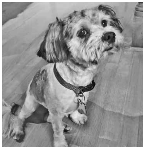
Sulu is a shih tzu/poodle/terrier mix.

My name is Sulu and if you adopt me, I promise that I will help navigate your life and we'll have lots of fun on our travels. I'm a very sweet, one-year old, male, Shih Tzu/Poodle/Terrier mix. The MSFR folks spotted me when they rescued Spock at the shelter and took pity on me. I came into the shelter as a stray and was grateful to make it there alive. I had been attacked on the streets by a larger dog and had multiple bite