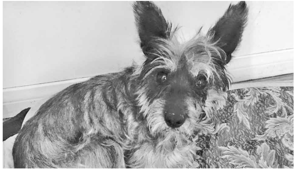
Kendell needs a second chance with a loving family.

wounds on my neck and legs. The guy was a real bully (Klingon?), considering I'm only a year old and weigh 10 pounds. Luckily, after x-rays were taken, we discovered that nothing was broken. I'm almost completely healed and ready to get on with my new life. Considering my history, I'm proud to say that I hold no grudges and get along well with other dogs. If you are interested in Sulu please email info@msfr.org for more information.