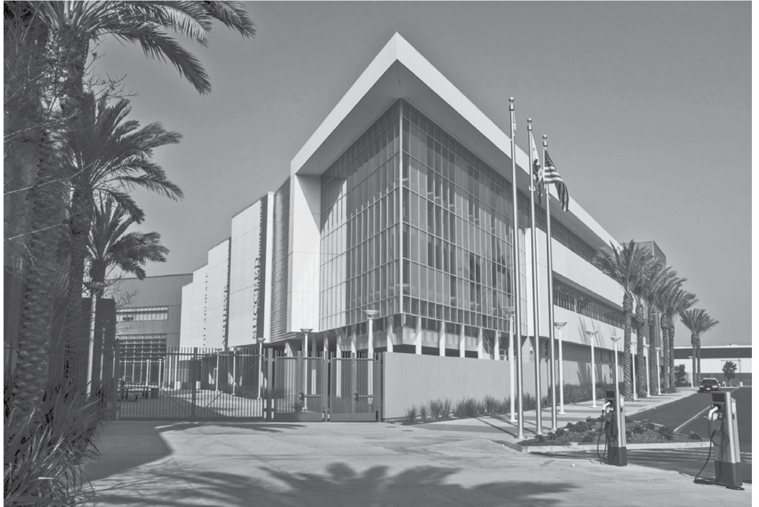
The beautiful, angular front of Lawndale High, at 14901 S. Inglewood Ave., home to the Cardinals.