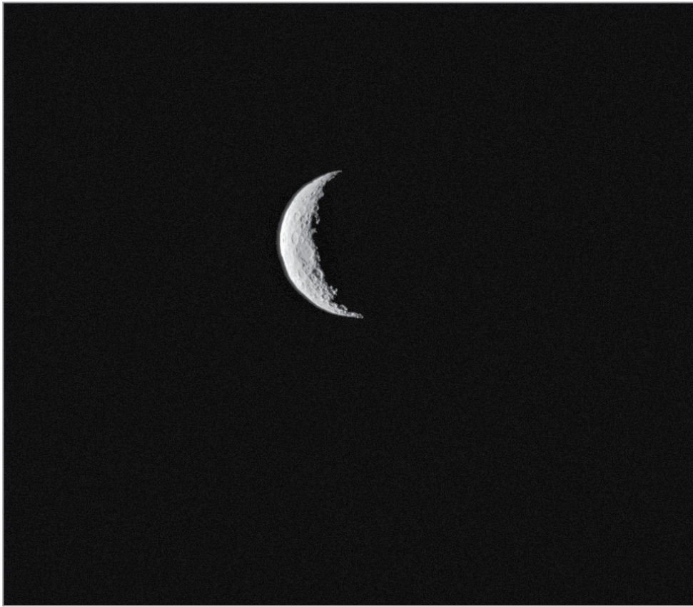
A view of dwarf planet Ceres taken by NASA's Dawn spacecraft on March 1, 2015, from a distance of about 30,000 miles.

Based on press release from NASA, provided by Bob Eklund