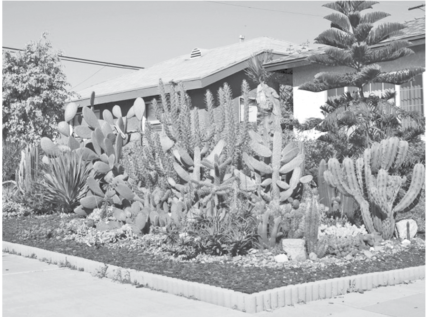
As Southern California has been enjoying another warm winter, the drought continues on (according to the National Weather Service, only 1.25 inches of rainfall were recorded at LAX in January). Sustainable yards like this one in Hawthorne keep the water use to a minimum.