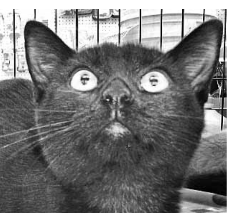
Genvieve is soft and cuddly.

Minkus is a not-quite 3-year-old orange tabby who can be a little shy, but is very snuggly and affectionate when he gets to know you. Once he knows you're his buddy, he asks for belly and chin rubs. He's used to living both alone and with another cat. As far as dogs go, he hasn't spent much time around them and he gets a little nervous/shy. He's very playful and loves wands, anything that rolls, and anything that dangles. Sunny spots are his favorite when he's feeling brave, and closets or blankets are his favorite spots when he's scared. Minkus will thrive in a calm,