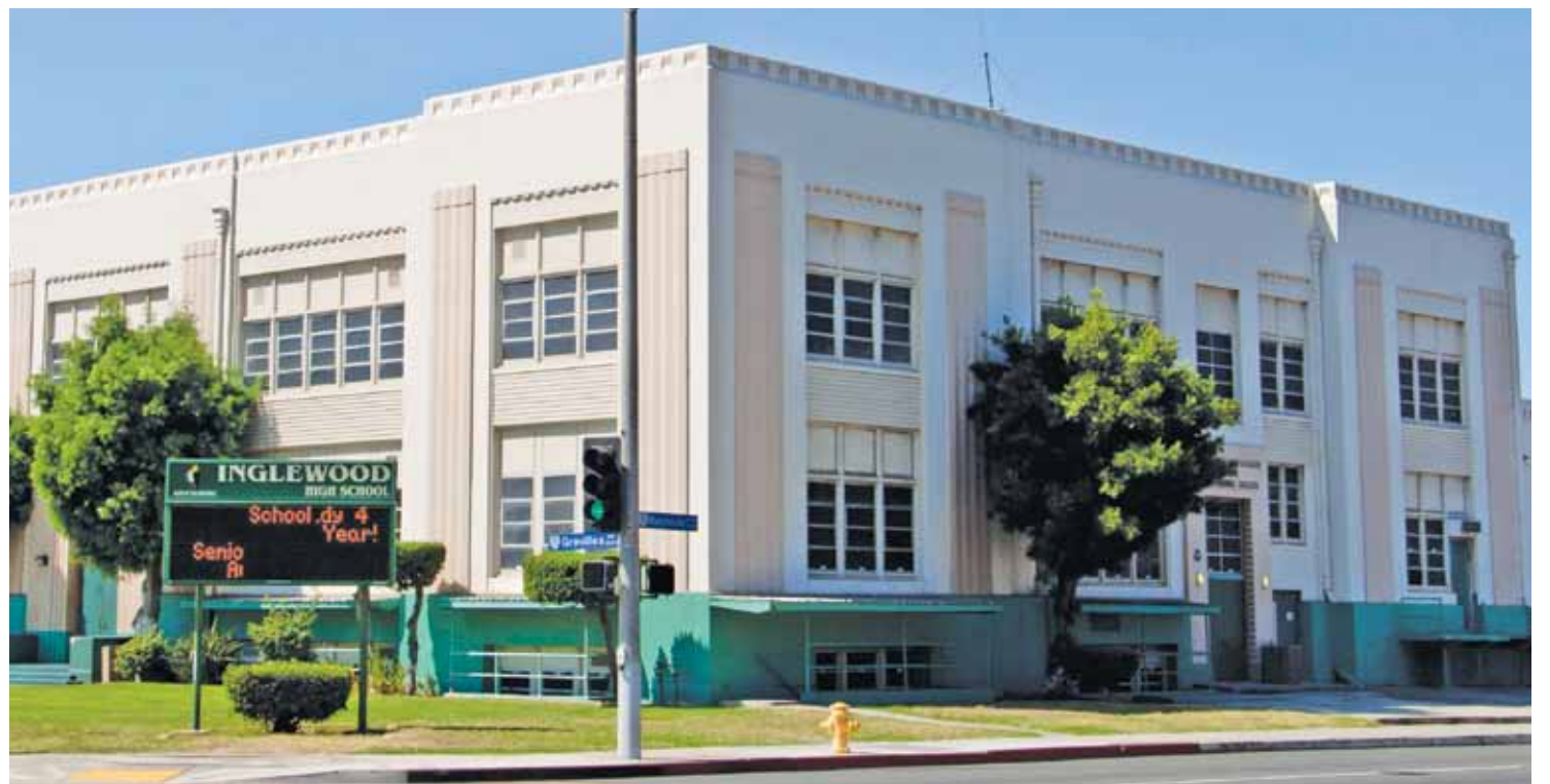
Inglewood High School recently received $35,000 in grand funding to help found Inglewood High Law School Academy to teach students critical thinking, writing, research, and debate.