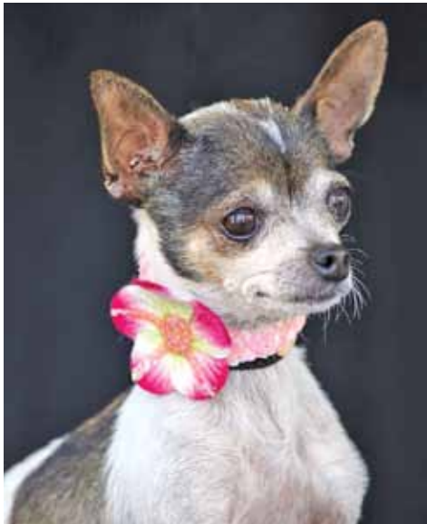
Mama Cass is only six pounds!

Mama Cass is sweet, friendly, gives lots of kisses and has a very bright sparkling personality. It's hard not to fall in love with her the instant you meet her. She is right around 4-6 years old and weighs 6 pounds. This is a really nice little girl who loves to be carried around or sitting on your lap or next to you on the couch. She is your