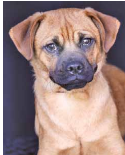
Gracie is a growing girl who loves to play, play, play.

To learn more about these and other wonderful dogs, visit our website at www.animalsrule.org . If a dog is on our website, it's available. Come to our Saturday adoption events from 11 a.m. – 3 p.m. at 305 North Harbor Blvd., San Pedro (just off the 110 near the cruise port). We are always in need of donations for veterinarian bills and our senior dogs. Donations can be made through our website or by sending a check payable to: Animals Rule Placement Foundation at 305 North Harbor Blvd., San Pedro, CA 90731. All donations are tax-deductible; we are a registered 501©3 non-profit organization. •