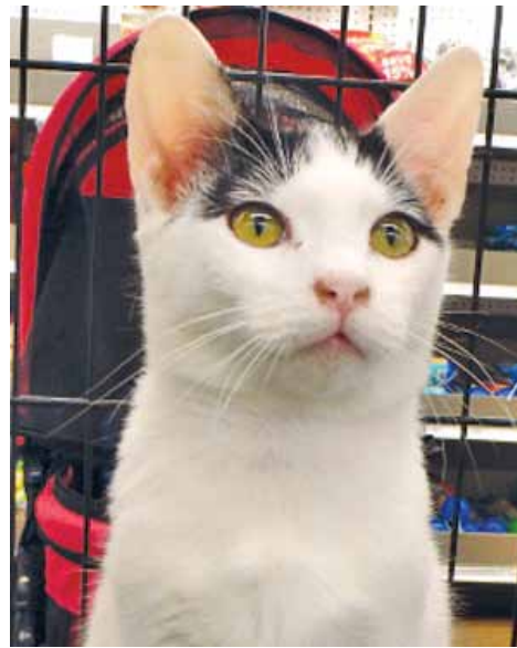
Micha is very adventurous and loves to explore.

Isabella is super affectionate, a total lap cat and loves belly rubs. Her big blue eyes will melt your heart and you will have a devoted companion who gives as much love as she gets. Her scoliosis makes her back a little crooked and has given her a spiral tail,