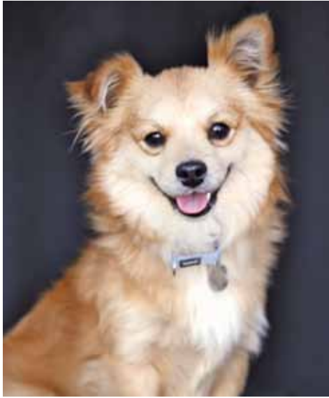
Billy is a sweet little guy who loves people..

Adopt a "pet without a partner" and give a homeless pet a second chance in life.