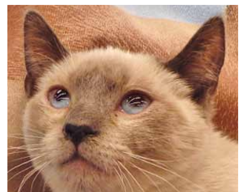
Suki is looking to be adopted with a companion.

On Saturdays, we have adoptions from noon to 3:30 p.m. in Westchester at 8655 Lincoln Blvd. just south of Manchester Ave. and also in Mar Vista at 3860 Centinela Ave, just south of Venice Boulevard. Our website lists additional adoption sites and directions to each location. •