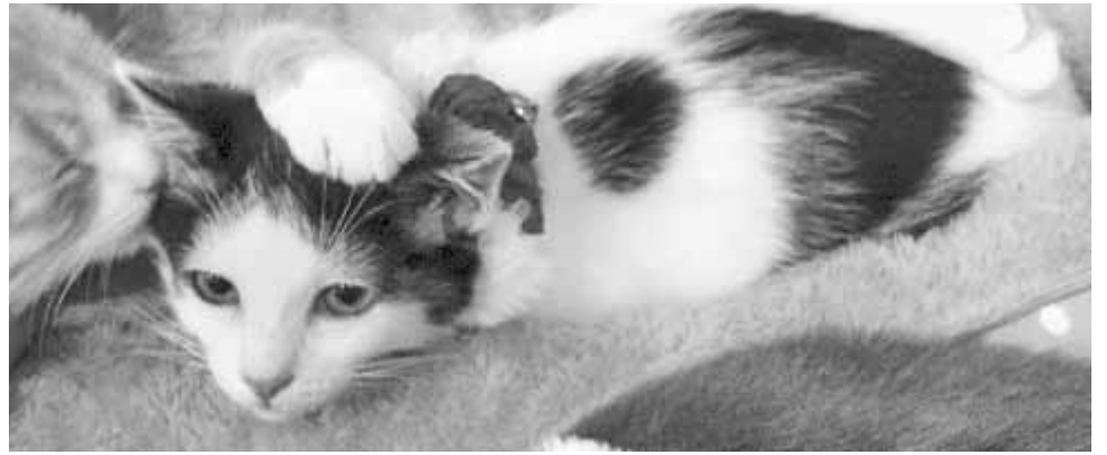
Moo is a small kitten who loves people.

Saving one animal won't change the world, but the world will surely change for that animal.