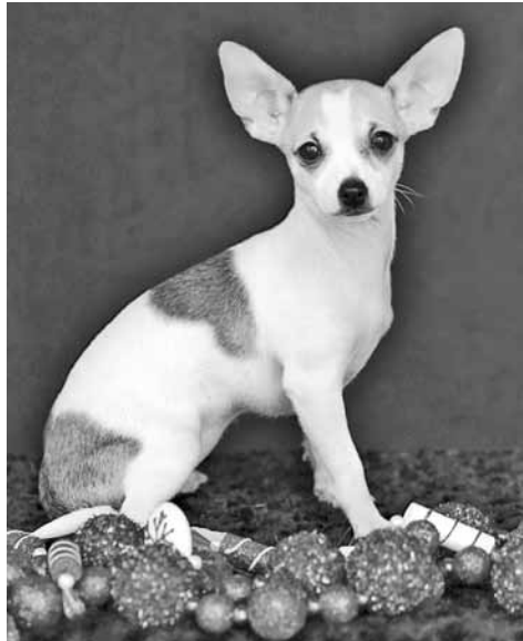
Dharma is a Chihuahua mix

Dharma is a Chihuahua mix puppy who was born on August 21, 2014. Her mother, Mama Cass, is a little gem and is five pounds full grown (she is also available for adoption). Dharma is the best little puppy