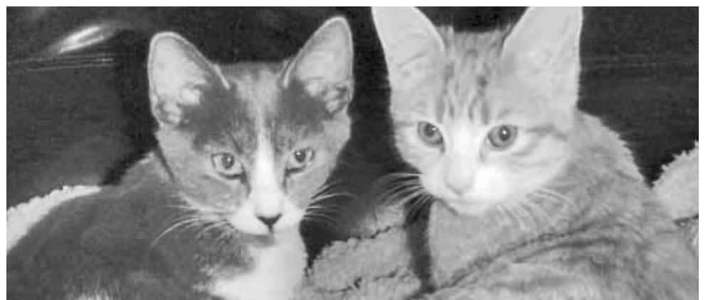
Sam (left) and Tiger are four-month-old best friends and would love to be adopted together.

On Saturdays, we have adoptions from noon to 3:30 p.m. in Westchester at 8655 Lincoln Blvd. just south of Manchester Ave. and also in Mar Vista at 3860 Centinela Ave, just south of Venice Boulevard. Our website lists additional adoption sites and directions to each location.