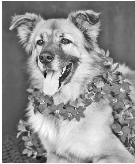
Rosie is a Golden Retriever / Shepherd mix

Adopt a "pet without a partner" to give a homeless pet a second chance in life. (Update on Louie, our 7 month old Doberman pup – Louie continues to improve. You can see his weekly progress on our website. Thank you for your donations and support.)