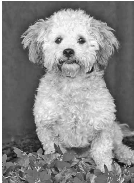
Loki is a YorkiPoo: a mix of Yorkie and Poodle.

Loki is a fabulous YorkiPoo - a mix of a Yorkie and a Poodle. He is fine with other dogs at the dog park or on walks, but at home, Loki likes to be the king of his castle