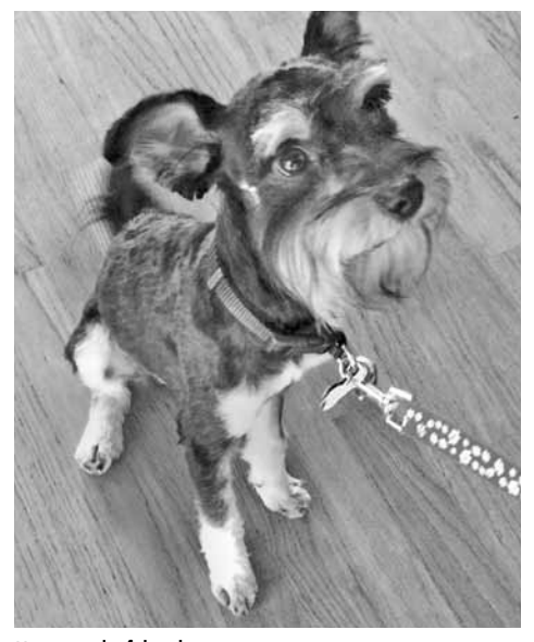
Manny is playful and sweet.

Hi! My name is Slater and I'm a 1-year old, male Miniature Schnauzer/Poodle mix who is 13 pounds of fun. I was rescued from a LA county shelter where was brought in as a stray. That is one scary place so is it any wonder that I was very frightened and skittish when the MSFR folks rescued me? Once I realized I wasn't going back there, I warmed up nicely to my foster family but I'm still a little slow in the trust department.