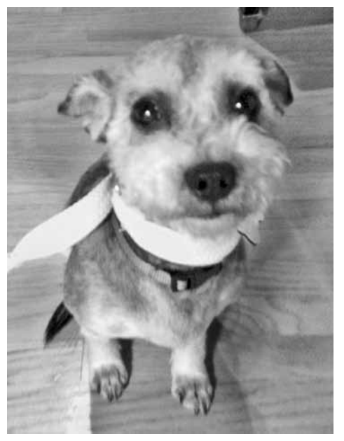
Slater is loyal and affectionate.

That's why it would be best to have a patient owner who is willing to give me time to earn my trust. Once I know I can trust you,