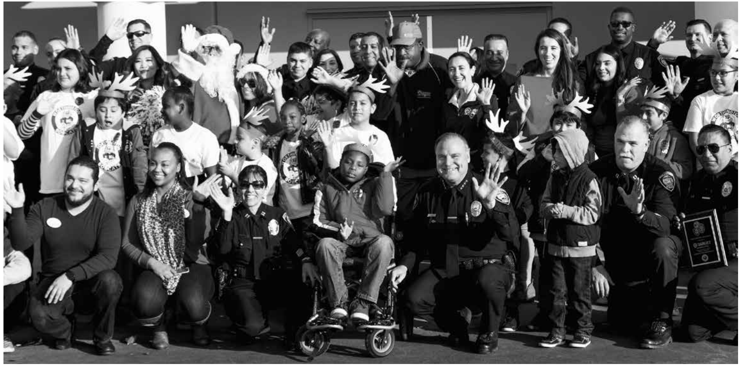
Last Saturday morning, the Los Angeles Rams joined the Inglewood Police Department and the Target Corporation for the 2017 Shop With a Cop Initiative held at the Inglewood Target. This year, Inglewood PD decided to partner with Aidan's House, a non-profit organization serving as a supportive resource for families with special needs children. Each child from Aidan's House received a $100 Target gift card and was paired with an Inglewood PD officer and Rams personnel to guide them through the aisles and purchase items on their holiday wish lists. Here is a group shot from the event.