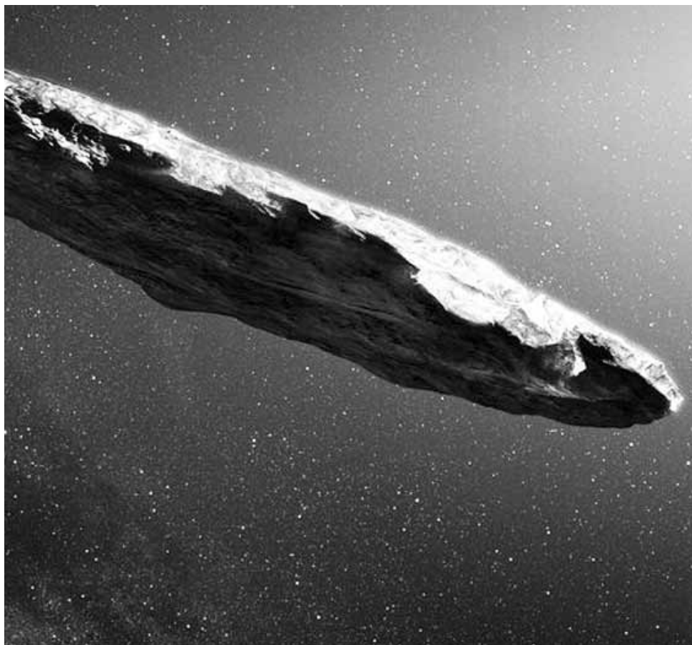
Artist's concept of interstellar asteroid 1I/2017 U1 ('Oumuamua) as it passed through the solar system after its discovery in October 2017. The aspect ratio of up to 10:1 is unlike that of any object seen in our own solar system.

Combining the images from the ESO telescope with those of other large telescopes, a team of astronomers led by Karen Meech of the Institute for Astronomy in Hawaii found that 'Oumuamua varies in brightness by a factor of 10 as it spins on its axis every 7.3