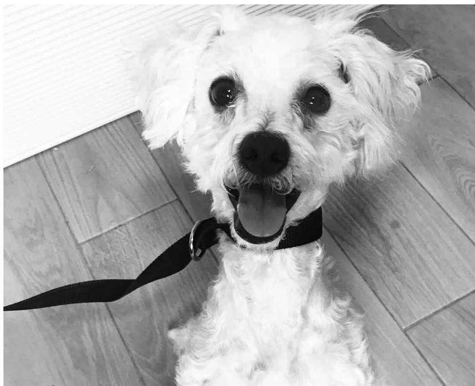
With help from our friends at Yellow Brick Road, Glory has found a new home and family. Goodness all around!