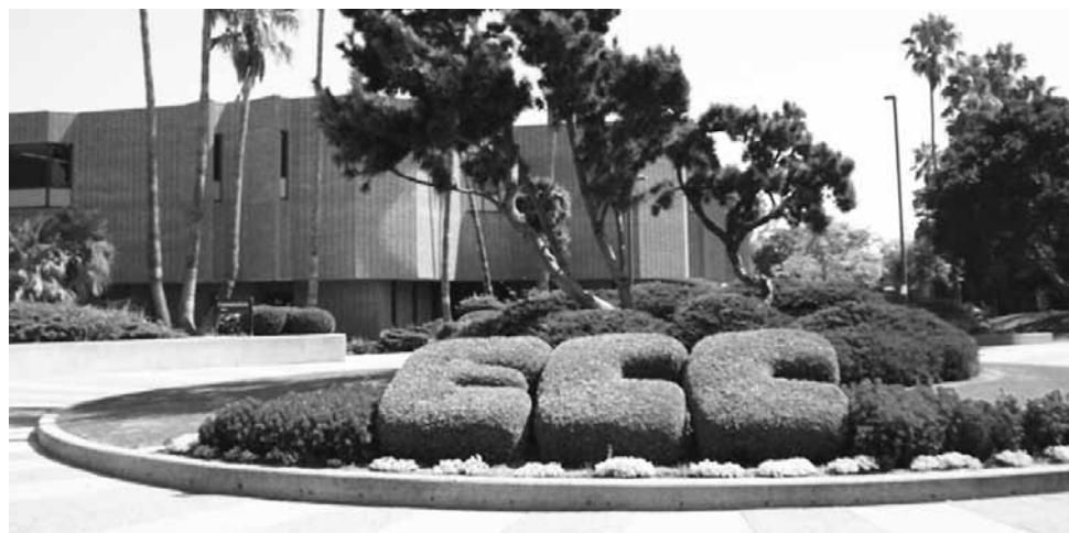
The study predicts skills El Camino graduates will need to enter the local workforce.

JP Morgan Chase sounded the alarm, too, about a middle-skill talent gap in greater Los Angeles. The financial service company predicted the L.A. County economy will grow by 12 percent in the next decade. That expansion is expected to create one million middle-skill jobs paying close to $30 per hour. Healthcare is expected to be the top job creator, along with global trade and logistics being so close to the Port of Los Angeles and LAX. •