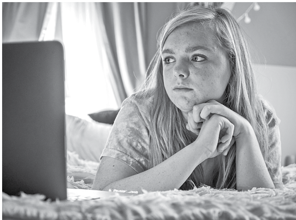
Eighth Grade

artificiality of pop consumerism is such a large part of kids' lives. The content they take in is then recreated and re-stylized in a feedback loop that results in being either so out of touch with reality or hyper in touch with a false one. This is what stirs Kayla, who is introverted and reserved at school but comes to life online making inspirational and self-help videos to an audience of none.