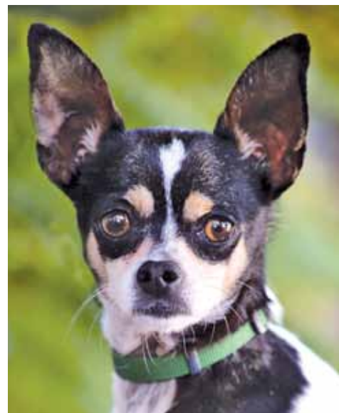
MoJo is just a little mini guy who needs someone to look out for him.

doggie door to do her business outside and has become a very nice little house dog. Katie is spayed, current on vaccinations, microchipped, fine with other dogs, and best with children over six.