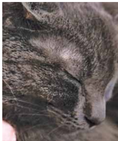
Norman is a green-eyed cutie who gets along with other cats

There are too many unfortunate pets who enter, but never come back out of the shelters. Lola was one of the lucky ones who came out through the Animals Rule Foundation and went on to find her own "Happy Tail."