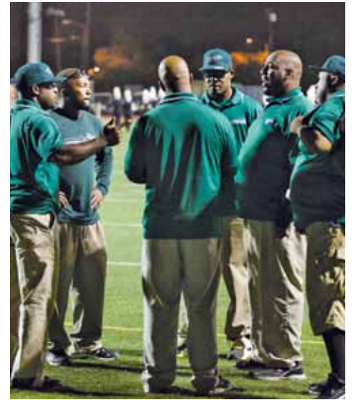
Inglewood High's coaching staff discussing strategy during the Inglewood - North game.