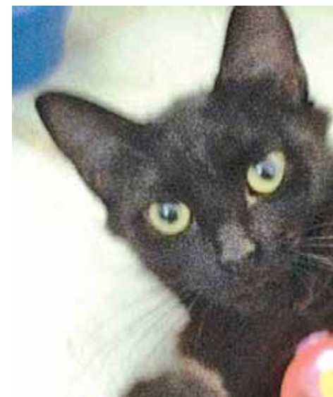
Mikaela is very sweet and was rescued with her mother Stevie.

These kittens are available for adoption through Kitten Rescue, one of the largest cat rescue groups in Southern California. All of our kitties are spayed/neutered, microchipped, tested for FeLV and FIV, dewormed and current on their vaccinations. For additional information and to see these or our other kitties, please check our website www.kittenrescue.org or email us at mail@kittenrescue.org . Your tax deductible donations for the rescue and care of our cats and kittens can be made through our website or by sending a check