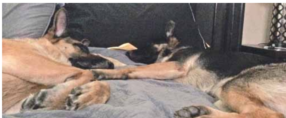
Lola has a new best friend and a new happy family.

MoJo was rescued from a shelter where he entered as an owner surrender; he could have been euthanized at any time to make room for other impounded dogs. MoJo is around one year old and weighs six pounds. In his foster home, we have found out he is housebroken and great with the other dogs. MoJo appears shy when you first meet him, but he warms up quickly. This love bug is very sweet, cuddly and playful. He is not accustomed to children and we noticed that they make him a little nervous, so we ask that any children in the home