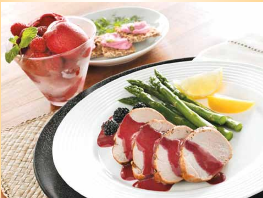
Delicious served with grilled pork tenderloin, chicken, duck, or grilled tofu.