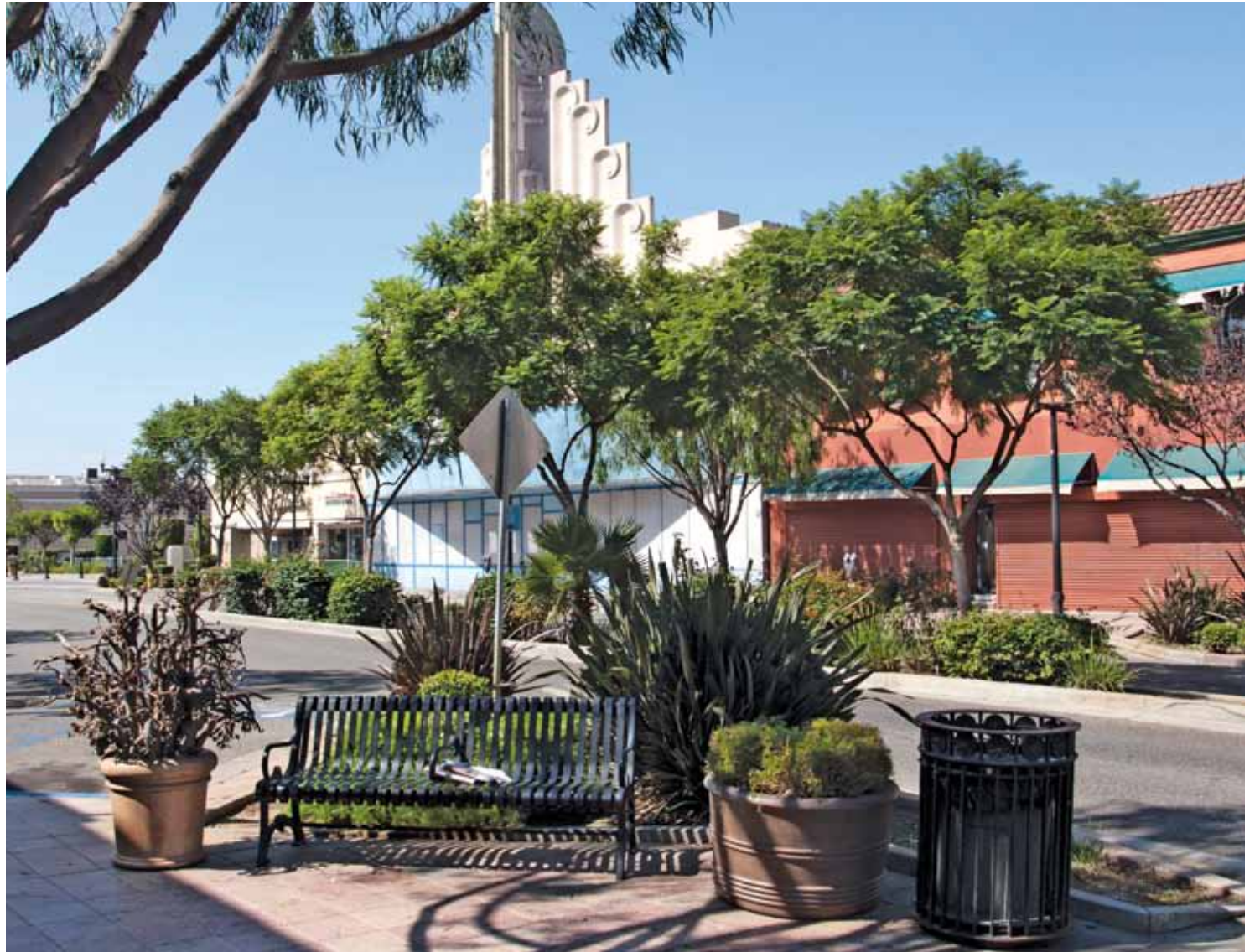
A bench waits invitingly under a shady tree on Market Street in front of the beautiful Art Deco façade of the Fox Theatre.