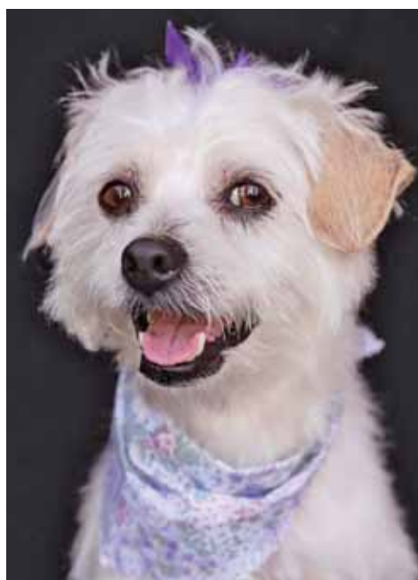
Pebbles is a Maltese/Terrier mix.

Katie was found in the parking lot of Vons with no form of identification and no microchip. This sweet girl is around 1-2 years old and weighs 12 pounds. We believe her to have some Dachshund in her due to her beautiful black and tan markings and possibly some Beagle with her sweet demeanor and soulful eyes. She is happy, loving, and good with the other dogs in her foster home. Katie has learned to use the