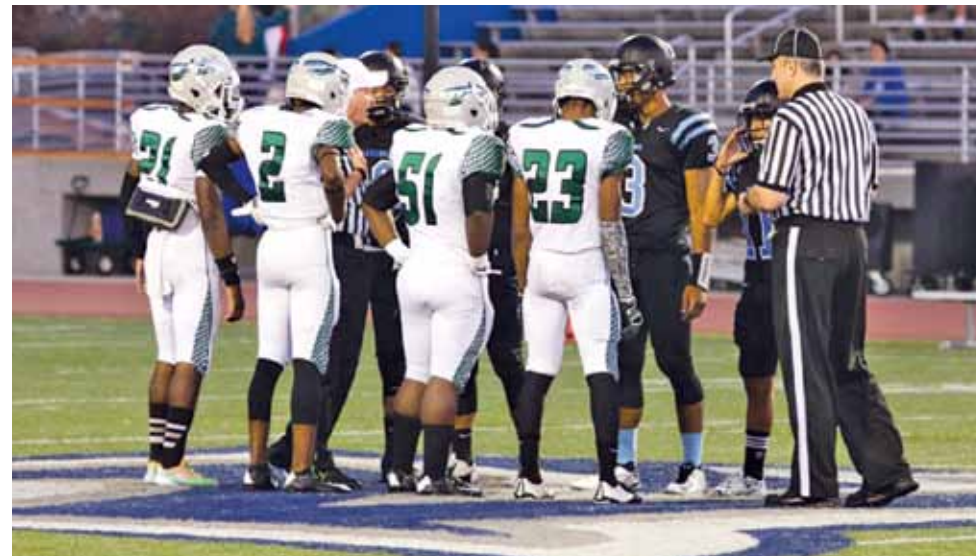
Inglewood faces off against North Torrance for the coin toss. Officials had to call a double forfeit in the third quarter after a fight between the teams.