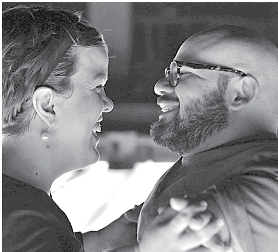
Far From the Tree , Courtesy of IFC Films.

On some level, we are all imperfect. That is what makes us human. The biggest takeaway