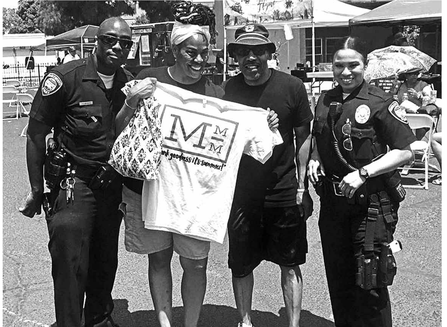
Inglewood Police Department officers interacted with residents and vendors at the Mingles Tea Bar Mid-Summer Madness event on Saturday, Aug. 4. The festivities included food vendors, tea tasting, face painting, entertainment, button-making, music and dancing, adult and children activities, and more.