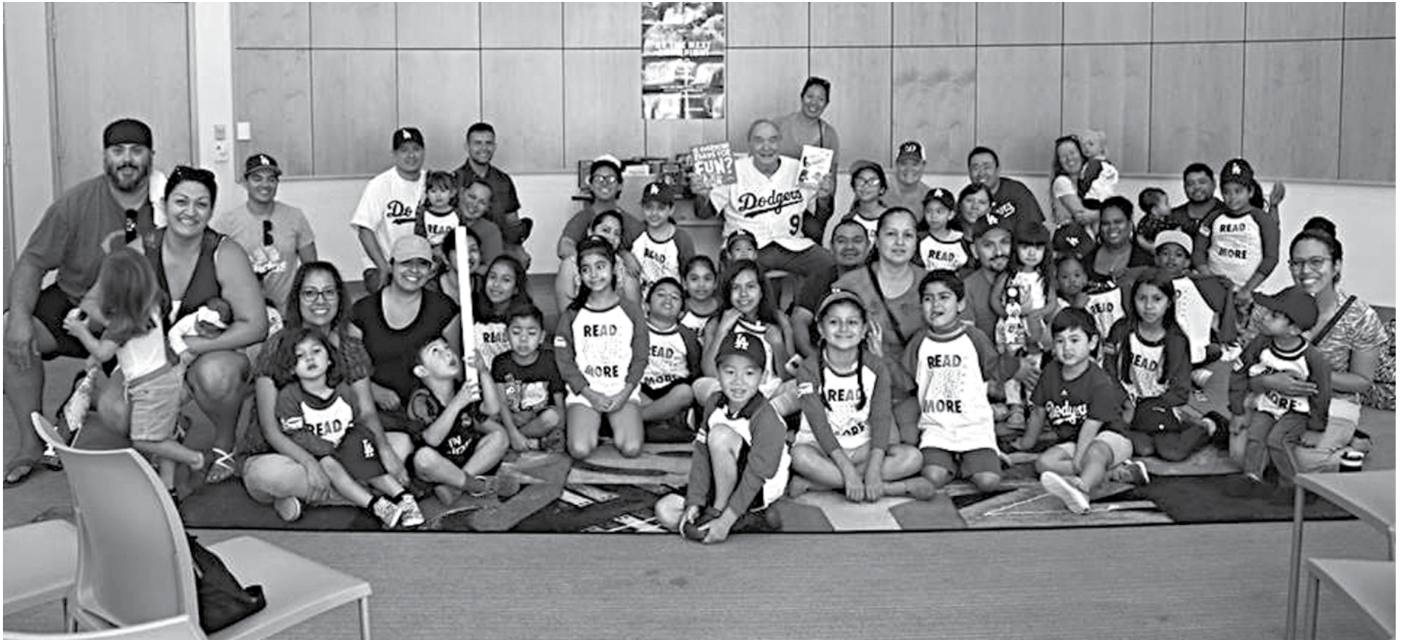
Late last month, former Los Angeles Dodger outfielder Al Ferrara (#9, who played on the 1963-1968 teams that won two World Series during that period) visited the Lawndale Library and read a story to the enthralled attendees.

“Everything you need for better future and success has already been written. And guess what? All you have to do is go to the library.”