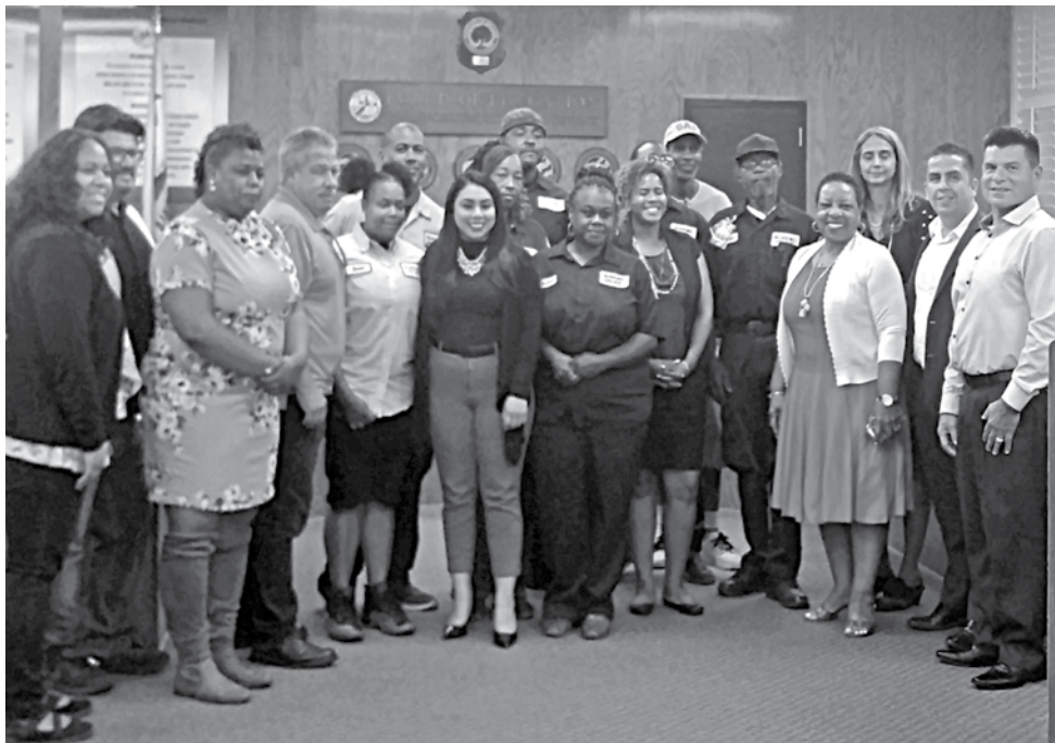
Facilities and Maintenance staff is commended by the Inglewood School Board for a year of unprecedented improvements at schools throughout the district.

The Inglewood School Board meets once monthly, unless otherwise noted. The next meeting is scheduled for Wednesday, Aug. 8, at 5:30 p.m. at 401 S. Inglewood Ave., in the Dr. Ernest Shaw Board Room. •