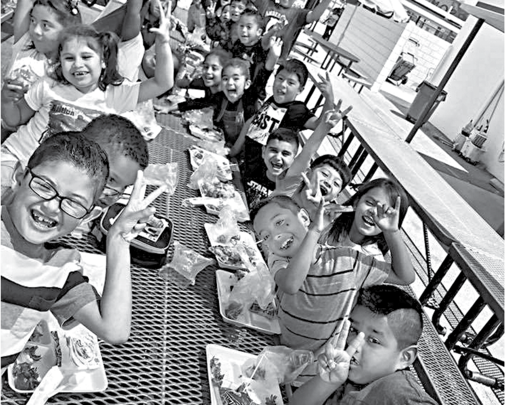
This year, Lawndale Elementary School District (LESD) is introducing a new meal program that will provide free meals for all students. In order to launch this program and keep it alive for years to come, the District is asking for support. To submit an application (deadline is Sept. 21, 2018), go to http://bit.ly/FreeMealsLESD . For information on the program, go to http://bit.ly/LESDfood .