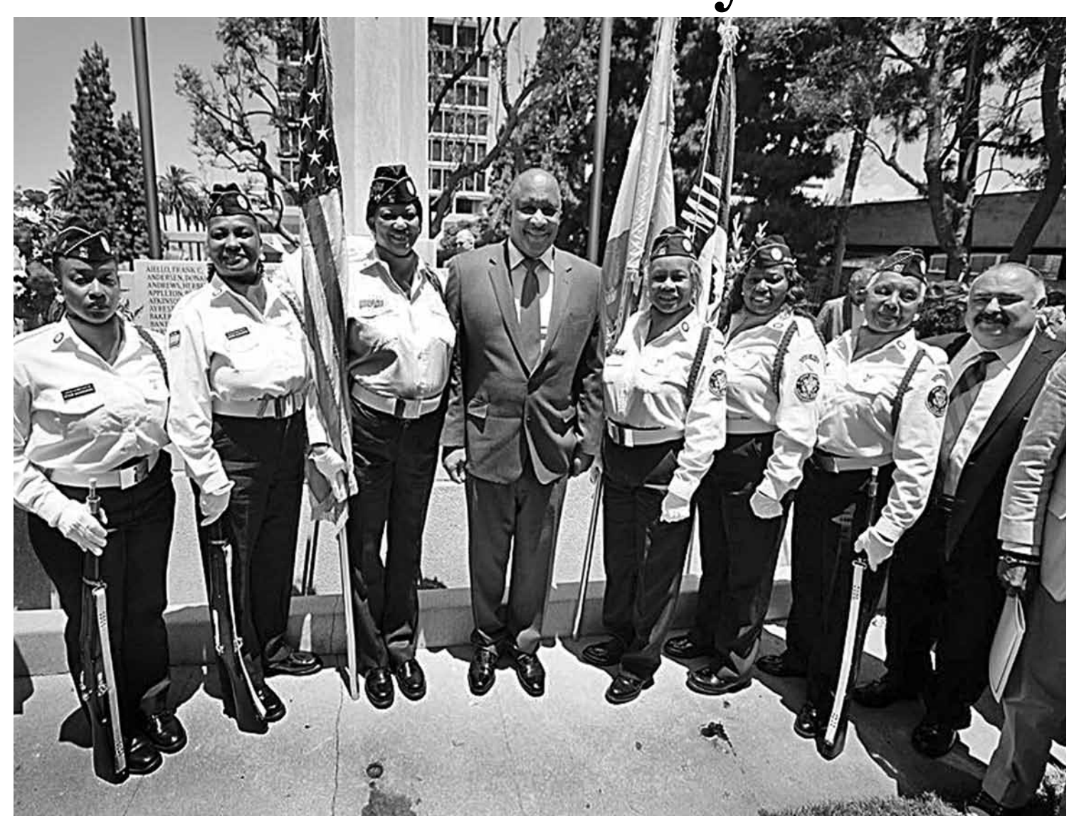
City of Inglewood officials led a local tribute on Monday in honor of the men and women of the United States armed forces who paid the ultimate sacrifice...