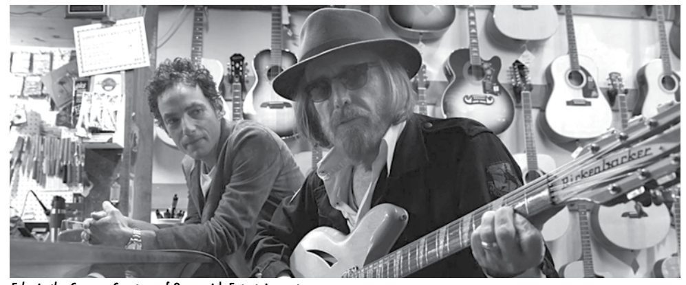
Echo in the Canyon: Courtesy of Greenwich Entertainment

and also perform them at a 2015 concert.