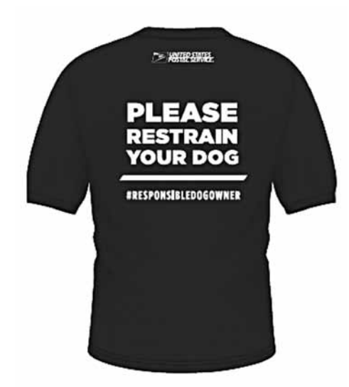
Postal carriers will wear this shirt on Saturdays during the summer with a message for dog owners.

Knowing a dog is in the vicinity only works so well, though. Many letter carriers say they were bitten from behind as they