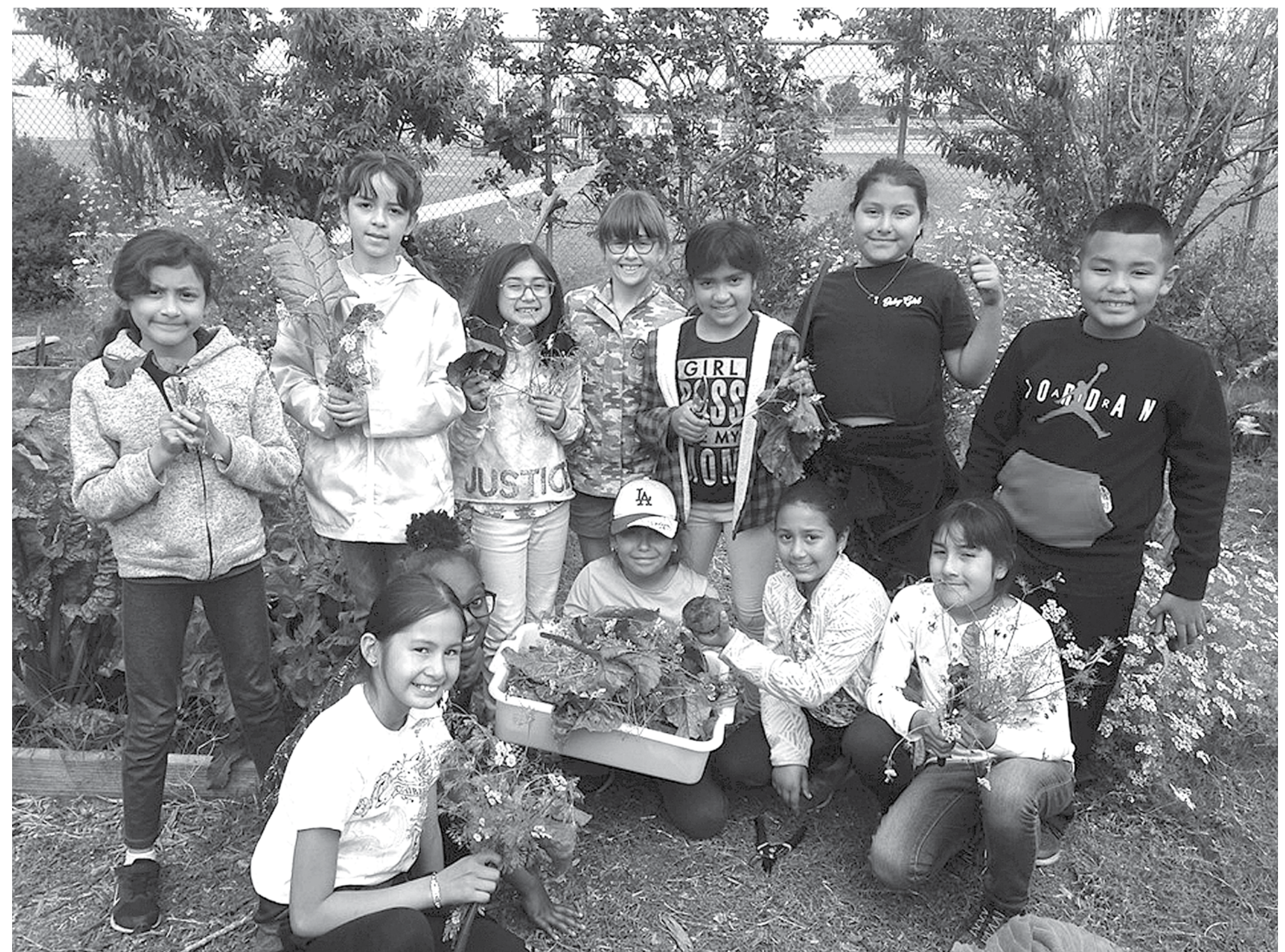
Anderson Elementary School's fourth grade garden club taught the youngsters gardening skills and provided lessons on healthy eating. The kids harvested -- and eventually cooked and ate -- two kinds of kale, Swiss chard, beets and cilantro.