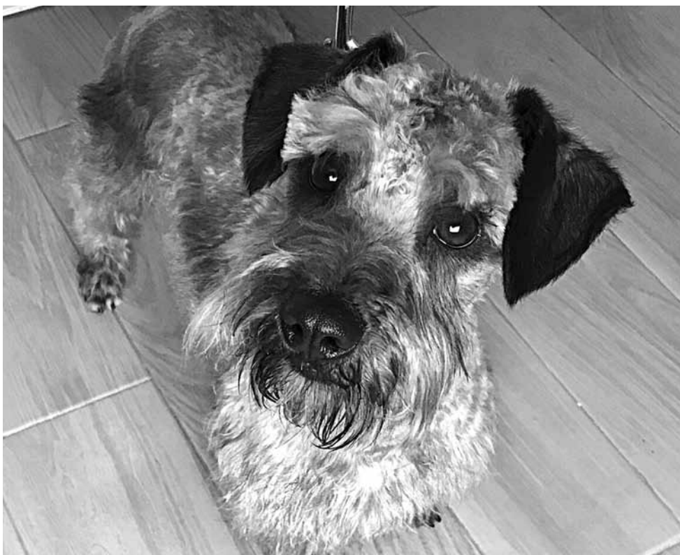
Congratulations to Billie and his new family!